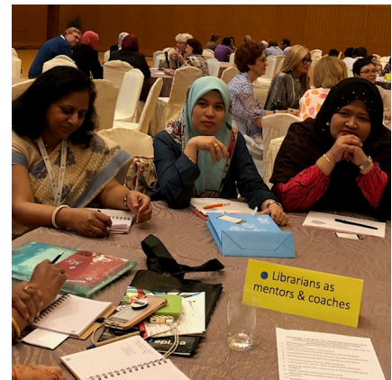
Please join us next year!