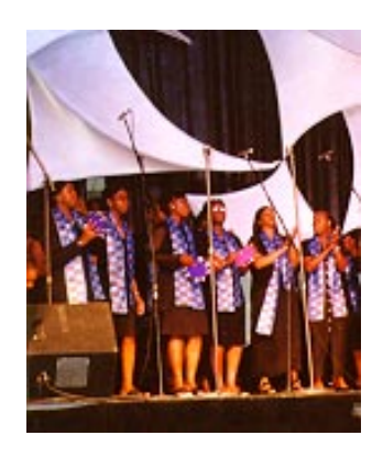
The Choir at the Opening Session

"Recognising that publishers and libraries share the common objective of the transmission of information from the author to the end-user, the mission of this Group is to