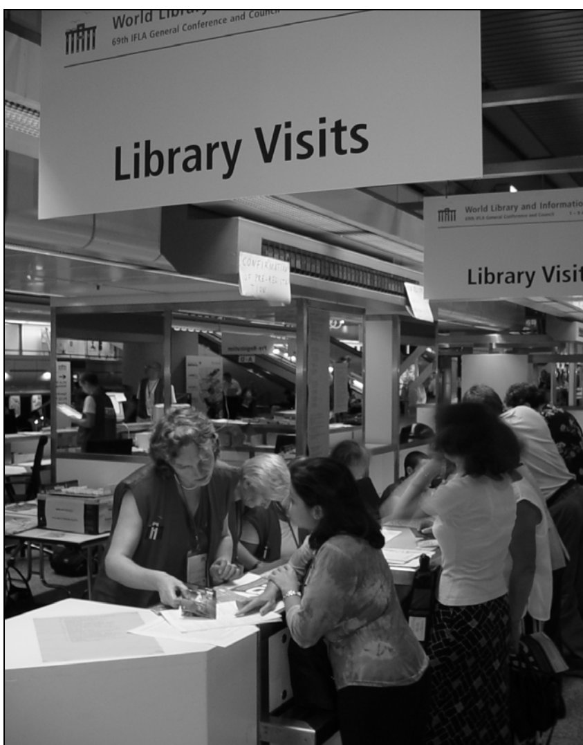
The registration booth :your gate to Berlin libraries

There are also additional brochures available for individual visits or for visits of small groups to several other libraries upon request. Please ask about these and the directions at the counter for Library Visits in the registration area.