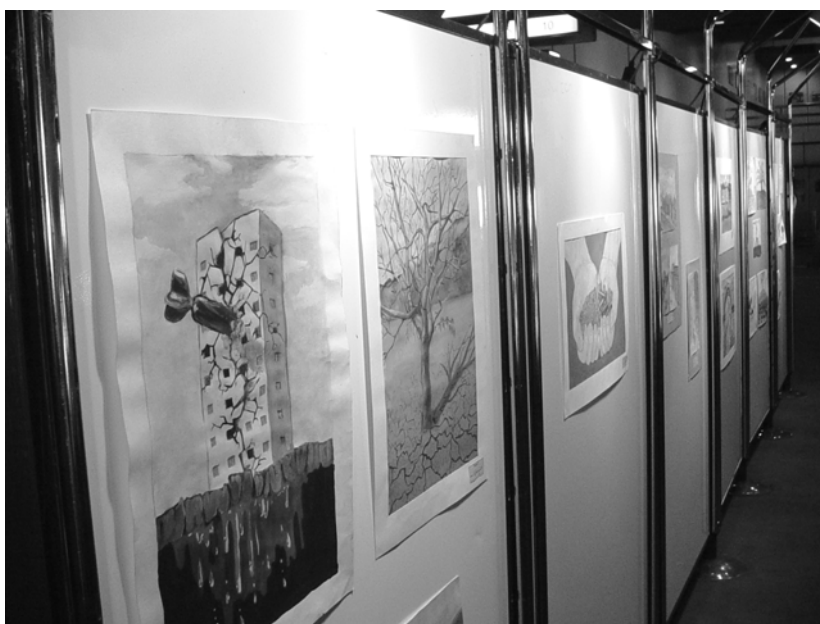
An exhibition of children painting's in hall 1

The scholarly and the political contributions of Jacob and Wilhelm Grimm were not limited to Germanic languages, literatures and folk traditions. In contrast, they maintained professional and personal relationship to many important scholars, writers and artists of their time – particularly because they knew the history of their own people as thoroughly as they did their understanding of other cultures and traditions was sophisticated and open minded.