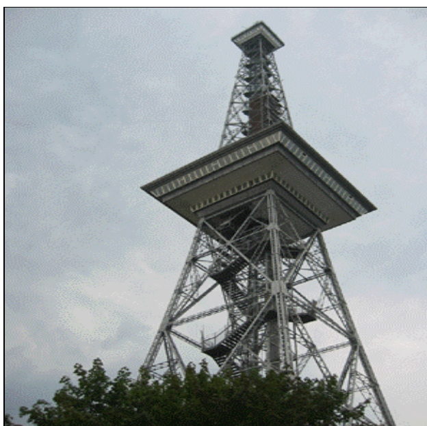
This is not the Tour Eiffel!

The Ministère de la culture et de la communication, Direction du livre et de la lecture and the Bibliothèque publique d’information (BPI) are represented at booth H38/H40 together with the bibliothèques municipales and bibliothèques départementales de prêt, while the Bibliothèque nationale de France (BnF) is to be found at booth H32/H33.