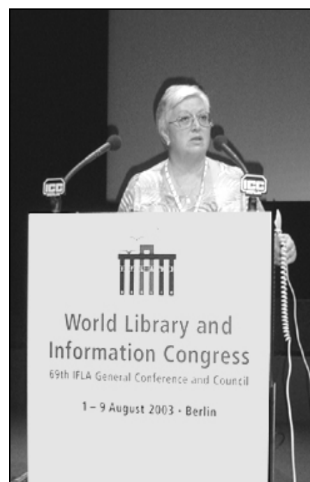
August 2003