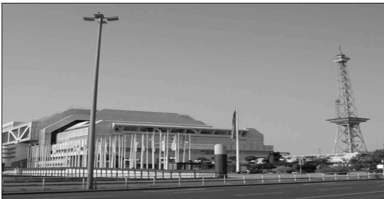
August 2003