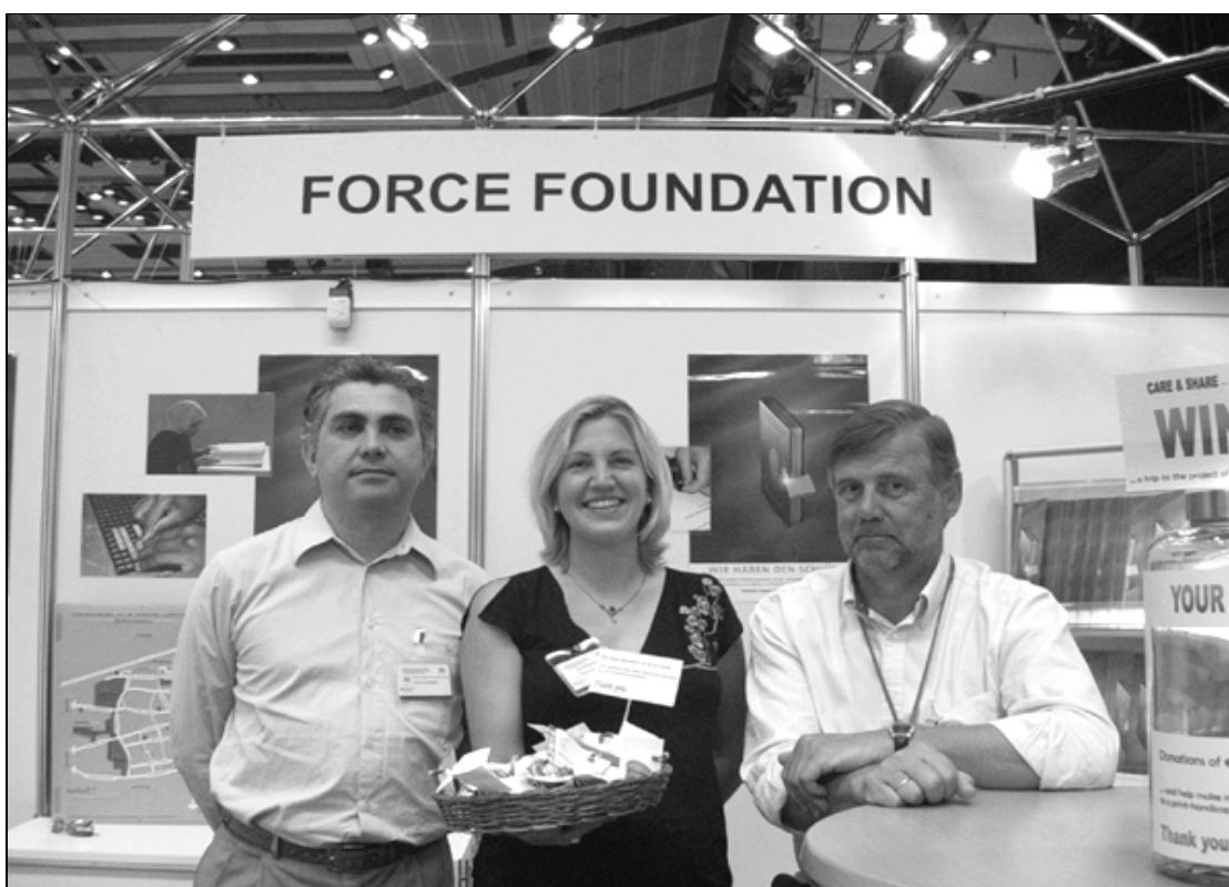
Impression of the Exhibition

Otherwise you may miss people trying to contact you or important announcements!