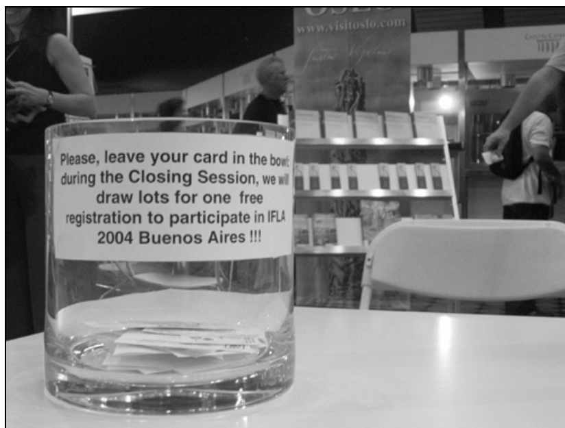
Buenos Aires Bowl

For more details, please visit the booth of the Bundesvereinigung Deutscher Bibliotheksverbände, BDB (Federal Union of German Library Associations), Area C, booth C 10