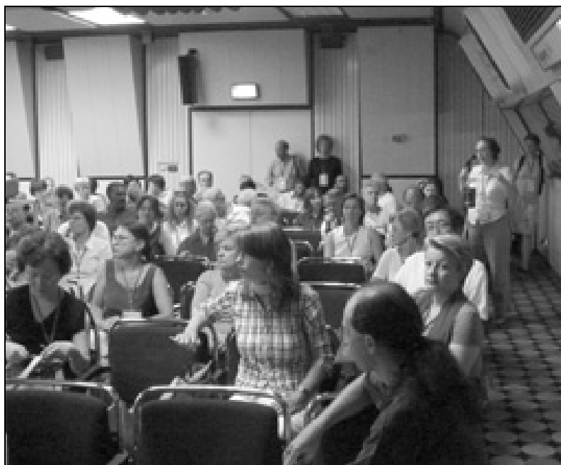
Meeting Knowledge Management