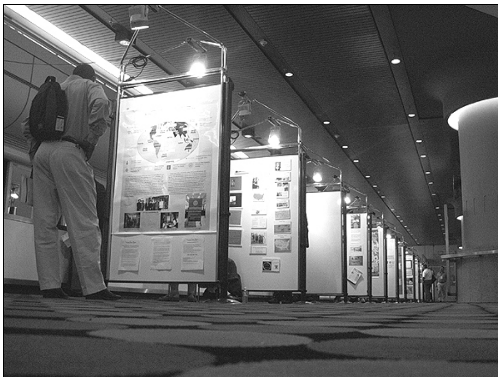
Visit the Poster sessions at the red side of ICC!