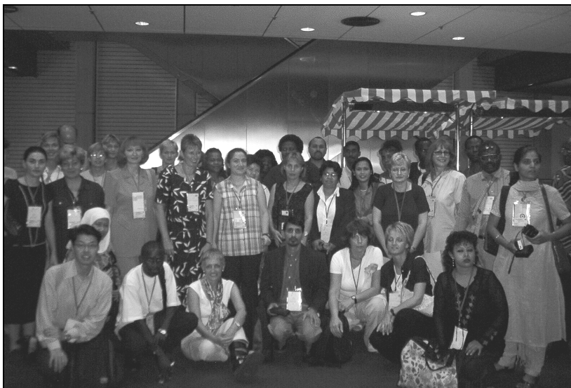
The Grant Recipients of 2003

This meeting served to provide the grantees with the opportunity to make first acquaintances and also gave them tips for organizing their stay in Berlin. Numerous photographs were taken to help the grantees remember the event – and which will most certainly also provide the background for reports about the IFLA Conference in the grantees' home countries.