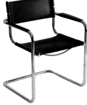
Free motion chair