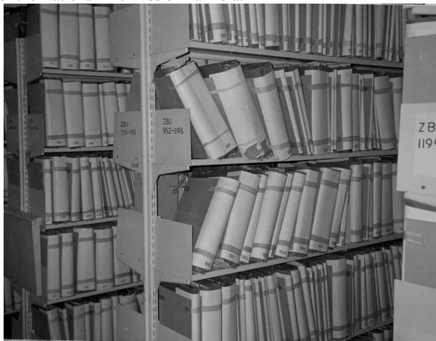
German colonial files in the National Archives of Namibia

The German Empire, which had taken possession of Namibia, the then South West Africa, from 1884-1915, set up a proper registry and filed their administrative documents with German thoroughness. When Germany lost the colony in the First World War, these documents were taken over and preserved by the South African administration, and today they form the much valued and much used core of the National Archives of Namibia.