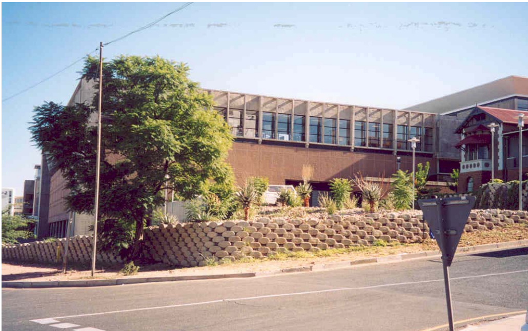
The new National Archives of Namibia Building

the records of the past. Therefore a sound basis to proceed with the repatriation of historical records has been laid.