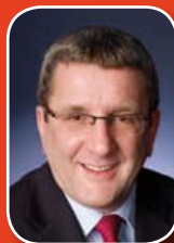
Mr. Régis Labeaume Mayor of Québec City