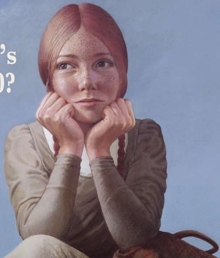
© Canada Post Corporation, 1975 stamp