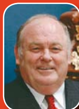
Mr. Michel Bissonnet President National Assembly of Quebec