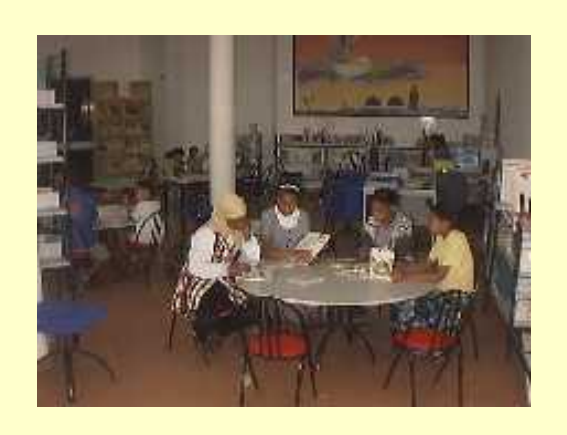
Photos: Children library in the National Center of Documentation, Rabat.

Morocco. This programme will allow the Ministry of culture along with the French Embassy to create 10 pilots libraries and 60 satellites reading points. In addition, it will strengthen the existing infrastructure in order to reach the remote areas.