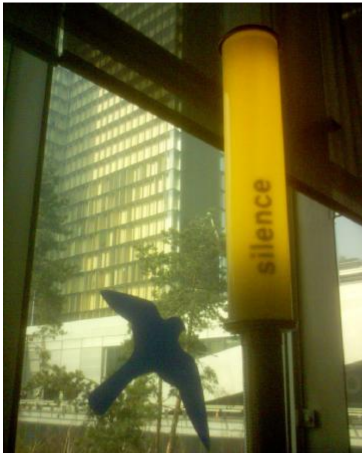
BnF - site François-Mitterrand (ph. Di Tillio)

2.2 Develop a set of guidelines governing the solicitation and acceptance of gift materials in libraries.