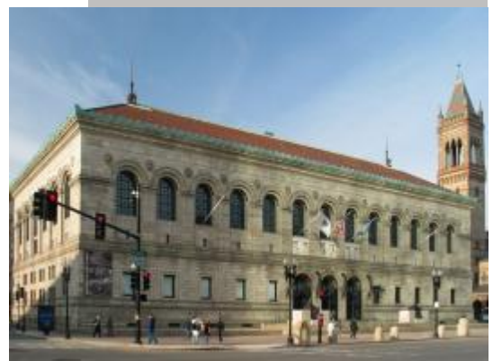
BPL

Hosted by: IFLA Document Delivery and Resource Sharing Standing Committee IFLA Acquisitions and Collections Management Standing Committee IFLA Reference and Information Services Standing Committee