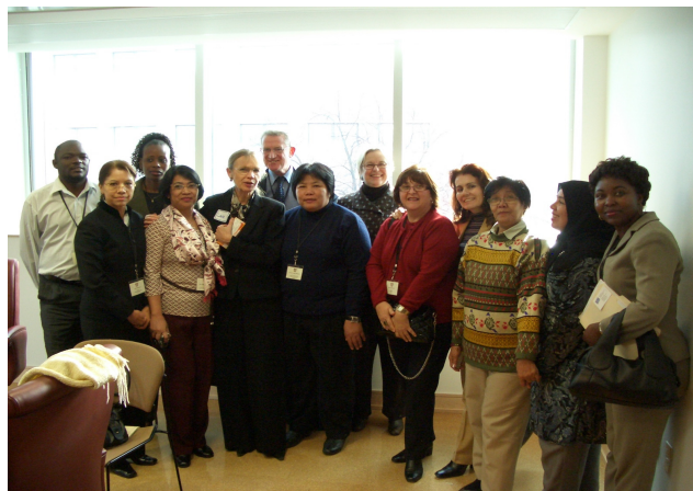
The Federation of Librarians with the director of Hartford Public Library.

FAIFE is a Standing Committee of IFLA with its focus on promoting the basic human right of access to information and was established in 1998.