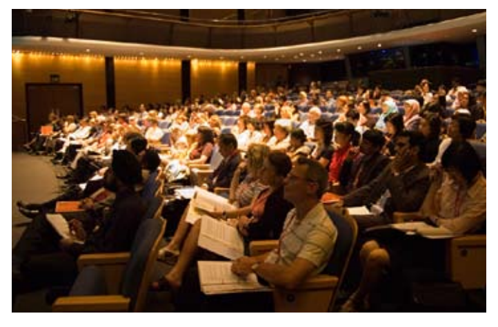
Delegates at the 10th ILDS Conference held at the National Library Building, Singapore.

In light of the current development, libraries around the world are taking pro-active steps to regularly examine the delivery of information to users and promoting and implementing the use of technology in streamlining international resource sharing and delivery, so as to better meet the needs of end-users.