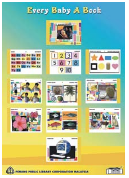
the membership and usage of the library. An eco-friendly, handmade, attractive, non-toxic, strong and sturdy, washable cloth book is the basic resource for this programme.

The objective of this programme is to get parental/ caregiver involvement in introducing the world of learning to the child at an early stage and to increase