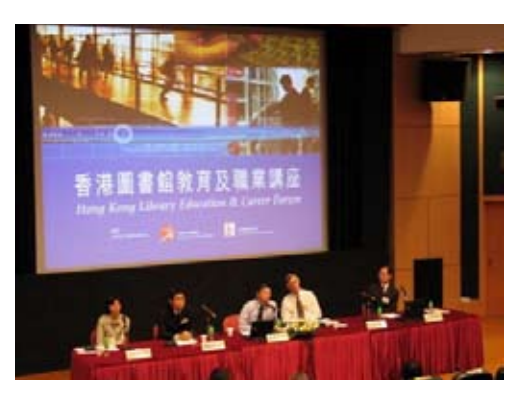
The HKLA Library Education and Careers Forum, 2007

A substantial proportion of the Association's members are students, undertaking various programmes in librarianship offered by tertiary institutions in Hong Kong and overseas. The