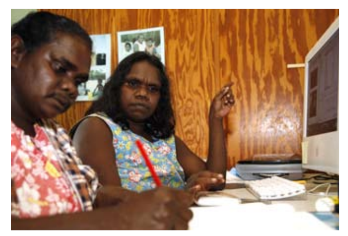
Library Staff in Angurugu Working on 'Our Story'