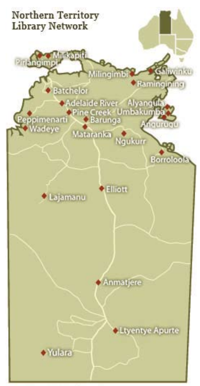
Northern Territory Library Network

Armed with cameras and computers, voice and video recorders, and scanners and printers, community members