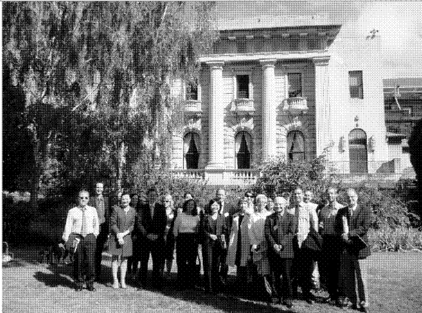
Group Photo in the Victorian Parliamentary Gardens. APLA Research & Reference Symposium Melbourne, Parliament of Victoria, Friday 8 th February 2008