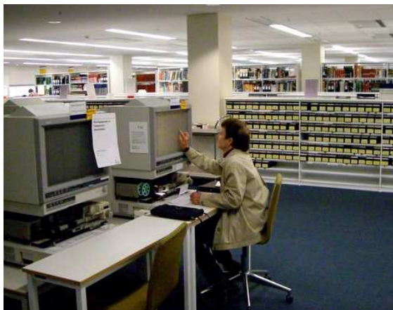
Microfilm Readers in the Family History area State Library of South Australia

Access is provided to the Times Digital Archives on the Library public access computers and we have microfilm copies of the paper itself from 1834 onwards. Once again, reading the Times can put ancestors' lives in context.