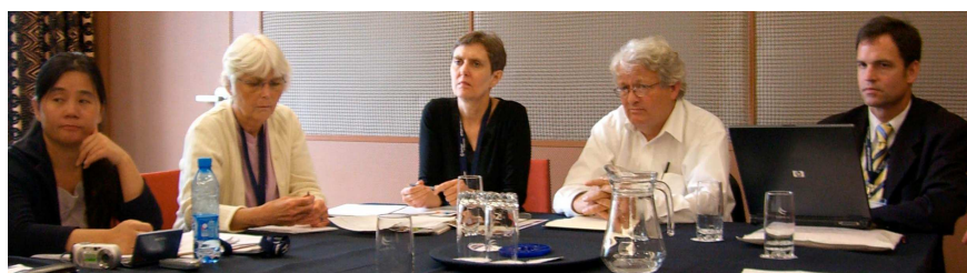
Members of the IFLA GENLOC Committee in Durban August 2007