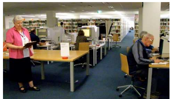
State Library of South Australia in Adelaide Family History area

The Bastyan Wing is now named after Catherine Helen Spence, Australia's first truly professional female journalist and the first female political candidate in South Australia. She was a fearless social and political reformer. Largely due to Catherine Helen Spence's influence on suffrage, South Australia became the first place in the world to give women the right to stand for Parliament. Her role in Federation was recognised nationally by her placement on Australia's Federation five-dollar note.