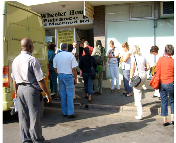
Entrance to the Durban Archives

participated in the tour, which also included lunch at the Indian Connection Restaurant.