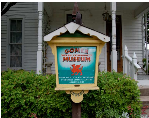
Gomer Welsh Community Museum, Ohio