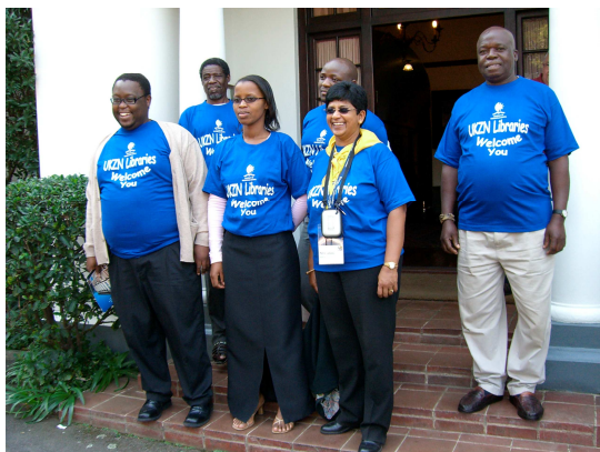
Guides at the Killie Campbell Museum

looking out over spacious gardens with indigenous shrubs and trees, high on Durban's Berea. The enthusiastic guides showed the artifacts, beadwork and paintings which were displayed - the beautiful treasures of South Africa in an absolutely magnificent setting.