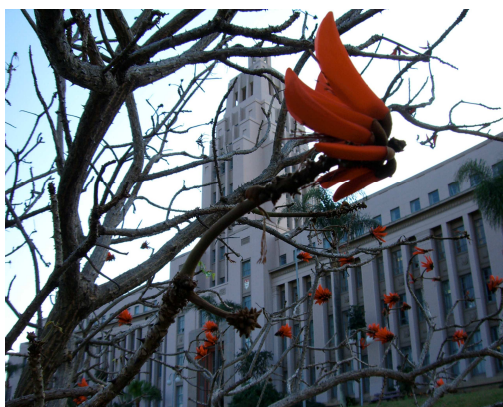
The University of Kwa-Zulu Natal

Visiting these libraries and repositories allowed