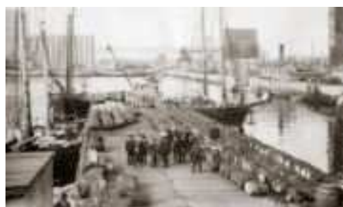
The port of Quebec City in the 19 th c

The response to date has been good, and the information collated has been very useful in assisting our membership and publicity drives. Relevant institutions can still respond to the questionnaire, as it will remain on IFLANET for the foreseeable future.