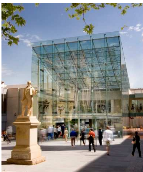
The State Library of South Australia