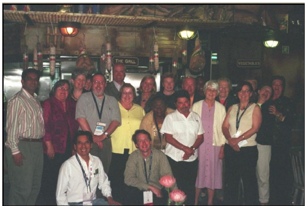
SLA members enjoying an evening out