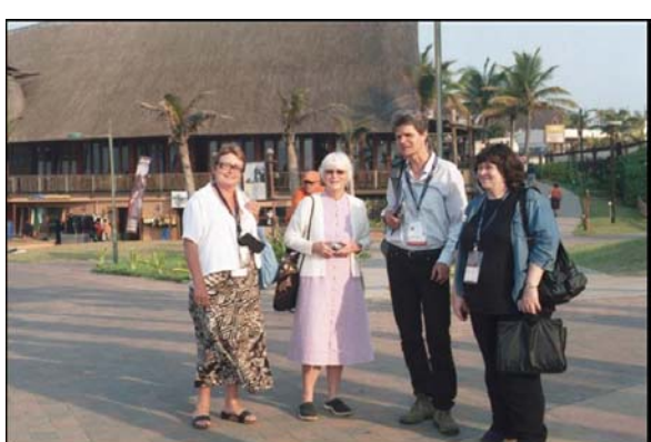
At the uShaka Marine World in Durban