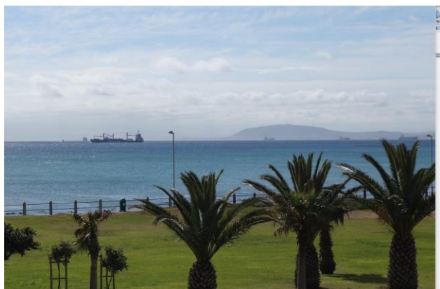
Cape Town on the shore of Table Bay.

A full report of the CATS business meetings has been posted on the CATS website, including reports from the sub-groups FRBR RG and ISBD RG and our liaisons in ALA CC:DA and ISO TC46.