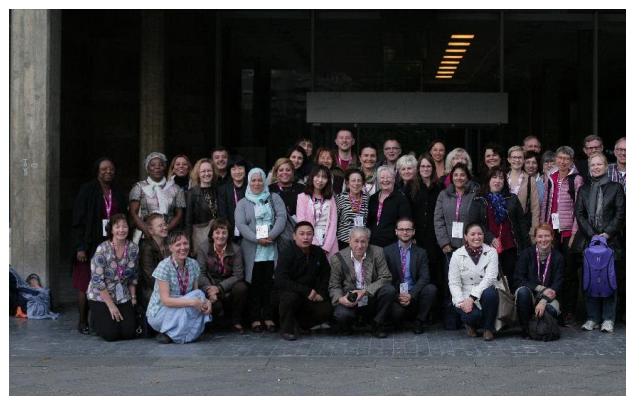
Fifty ISSN experts representing thirty-seven countries and five continents gathered at the National Library of Serbia.

This meeting demonstrated once more the commitment of the whole network to better meet new usages and improve its visibility.