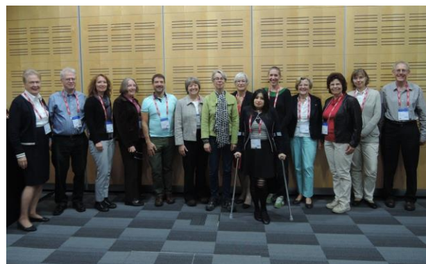
The Classification & Indexing Section assembled in Cape Town.