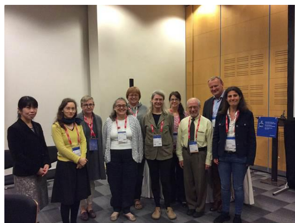
The Bibliographic Section (some members were absent) in Cape Town.

This summer we officially launched the Best Practice site, and the plan is to continually develop it with more guidelines and examples. You will find an article about the planned revisions for this year in the newsletter. We are also planning to integrate the National Bibliographic Register with the Best Practice, to offer a better overview of what is being done by the different National Bibliographic Agencies in each country.