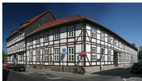
City Museum Göttingen, Germany.

Finally, a forum has been added to the EDUG website to provide a venue for discussion about topics in the Dewey Decimal Classification that warrant amendments to better serve European users. http://edug.pansoft.de/tiki-forums.php . All topics added to the forum will be discussed at the upcoming EDUG meeting.