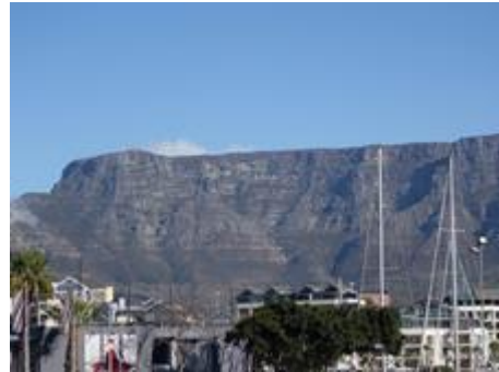
With a view to Table Mountain.

I wish you all good holidays, and all the best for the CATS year of 2016 (for a sneak peak, check out the separate text in this newsletter!