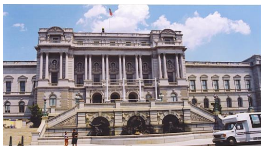
Library of Congress.

classify their collections according to DDC. This figure represented an increase of 19 percent from the previous year, even though staff attrition has left the Program with only four fulltime classifiers. Their work was supplemented by the use of the AutoDewey software. AutoDewey allows for automatic assignment of DDC numbers through use of a Library of Congress Classification (LCC)/DDC correlation tool.