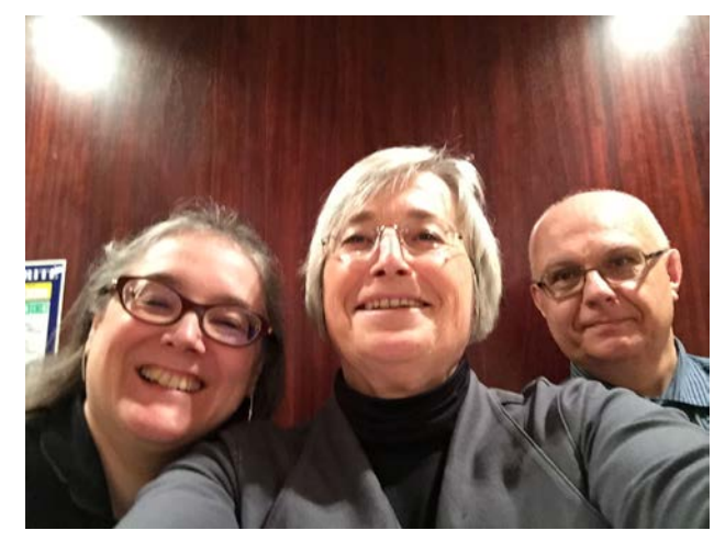
Caption: CEG members selfie!

The responses came from 13 different countries, as well as from multi-national or international groups.