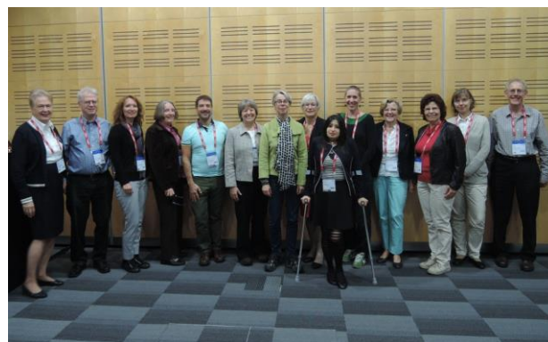
The Classification & Indexing Section assembled in Cape Town.