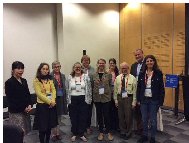
The Bibliographic Section (some members were absent) in Cape Town.

This summer we officially launched the Best Practice site, and the plan is to continually develop it with more guidelines and examples. We are also planning to integrate the National Bibliographic Register with the Best Practice, to offer a better overview of what is being done by the different National Bibliographic Agencies in each country.