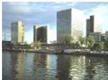
Photo: Bibliothèque Nationale de France (François-Mitterrand Library).

Paris early Spring... Expect a report from the event in the next issue of this newsletter!