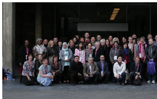
Fifty ISSN experts representing thirty-seven countries and five continents gathered at the National Library of Serbia.

This meeting demonstrated once more the commitment of the whole network to better meet new usages and improve its visibility.