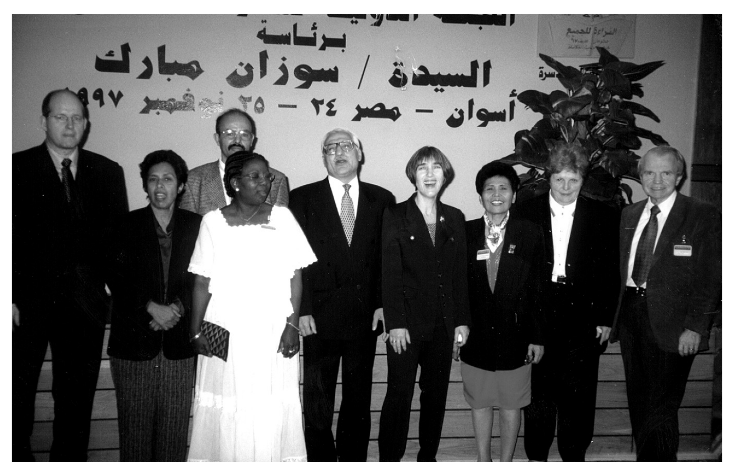
UNESCO panel "Reading for All" Aswan, Egypt 1977