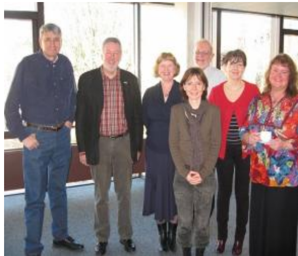
Members of the Standing Committee at TIB, Hannover, Germany February 2009.

Discussions included the final approval of the updated Principles and Guidelines, the selection of papers for the Milan Open Session, planning for the Satellite in Brisbane, 2010, and the selection of papers and programme design for the 11 th IFLA ILDS conference to be held in October later in the year, in Hannover, Germany.