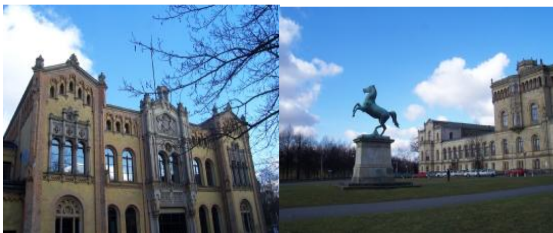
The beautiful University location of the Hannover meeting, February 2009.