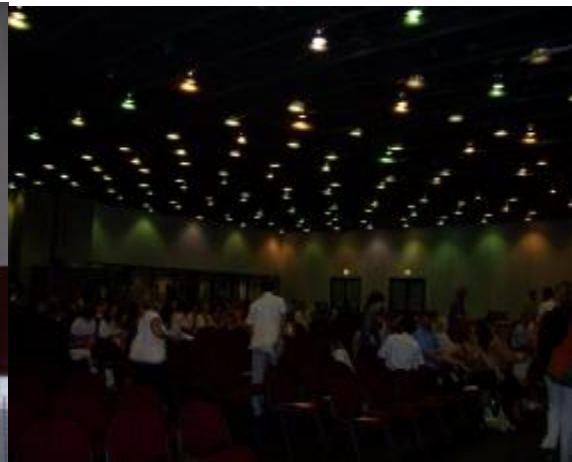
Delegates at the Open Session