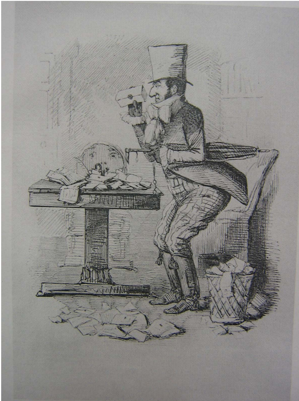
Fig.1, “Paul Pry at the Post Office” showing the Home Secretary, Sir James Graham, opening and reading the correspondence of Italian political exiles in England before disclosing the contents to the Austrian authorities in Italy from Punch, or The London Chiarivari, Vol. 7, 1844.

and “The Post-Office Peep-Show” which portrayed dubious foreign figures in military or diplomatic uniforms, queuing up to take a peep at letters in a miniature, model ‘theatre’ of the British Post Office in London, on payment of a penny. 3