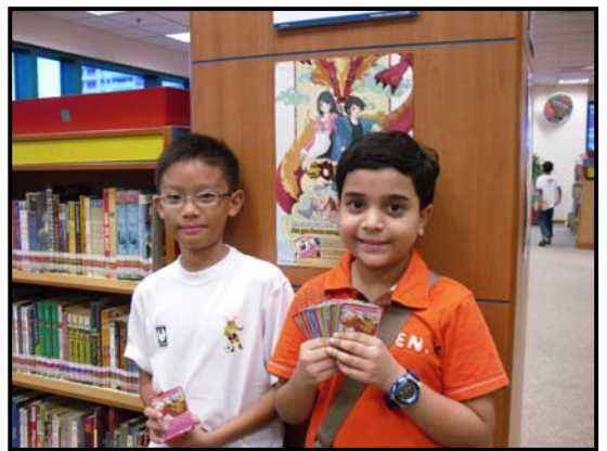
Boys at Woodlands Regional Library showing off their collection of Quest cards with the Quest poster in the background

The mechanics of Quest is simple—borrow books and collect cards. With all 60 cards lined back to back, children would be able to read part of the story.<sup>2</sup> In addition, the cards can be played like any ordinary trading card set as each card has points and power values which gives children the incentive to collect multiple cards. The Quest format is instantly recognisable to children and no additional effort or publicity is required to get their support and understanding of what to do. What worked out in NLB's favour was that children took it upon themselves to encourage their friends to take part in the programme to facilitate their opportunities for card trading. Peer to peer recommendation, in this case, was more effective than any poster or publicity campaign.