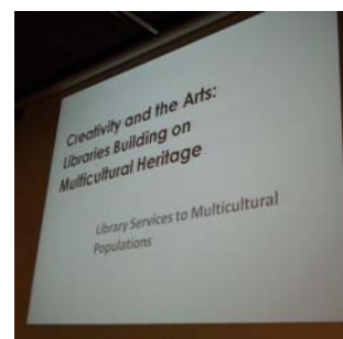
Creativity and the Arts Session in Milan

During IFLA 2009 in Milan in August the Section held an interesting and well attended session on Creativity and the Arts. The session provided a narrative overview of a variety of approaches from different parts of the world. The Section also presented a Poster Session on the Multicultural Manifesto which received an enormous amount of interest from conference delegates.