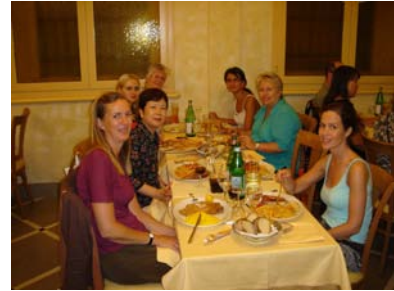
Milan, Section Dinner