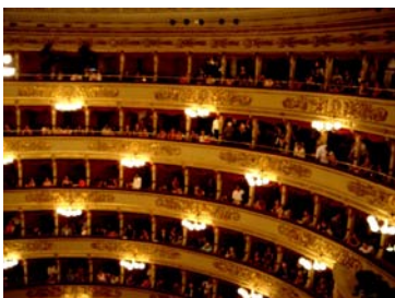
La Scala Theatre

the three meetings in Milan, the members still found time to socialize at our Section dinners, attend a special performance of