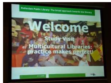
Study Visit – First Day

As a guest speaker, who was invited to the Study Visit, it was a great occasion to get to know other librarians and people who are working on those topics. I enjoyed also Rotterdam very much and I felt very comfortable