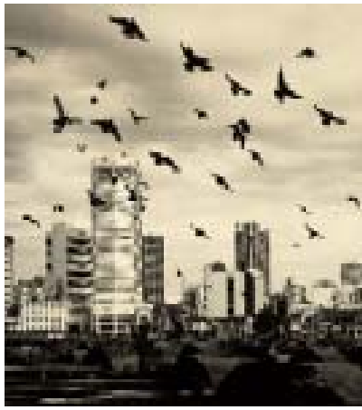
Pigeons by the Singapore River, 1978