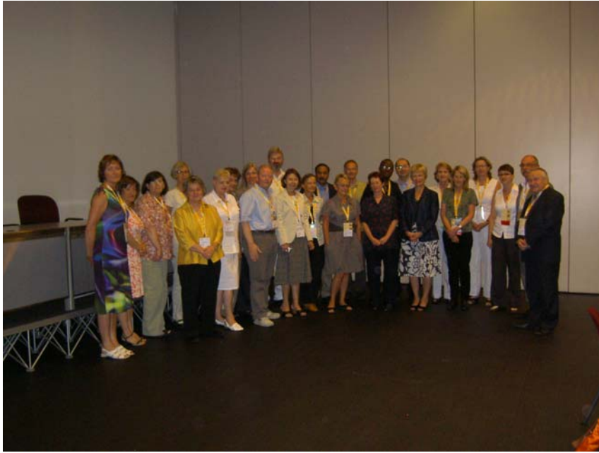
Members of the Standing Committee and Observers, Milan 2009