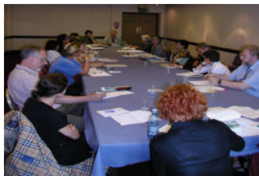
The Standing Committee at work Glasgow, August 17, 2002