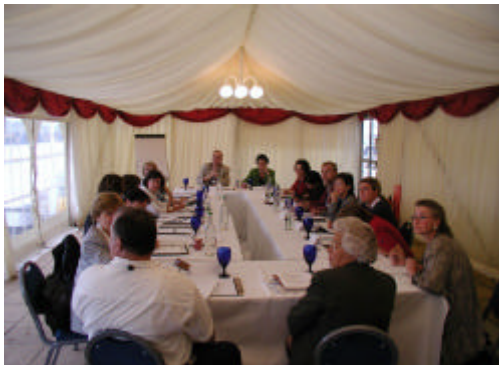
Standing Committee...still at work. On the Clyde, Glasgow, August 23, 2002

As a member of the new IFLA PAC Advisory Board, the Section Chair has striven to increase consciousness of the importance of this Core Activity and help it to be maintained and funded.