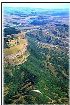
Durban The 1000 Hills