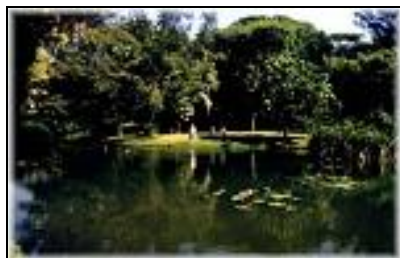
Durban's Botanical Gardens