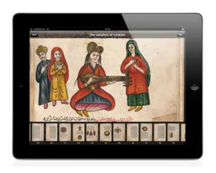
Illustration 4: "Oriental Treasures of the Bavarian State Library" as iPad application

Moreover, the application comprises select examples of Arabic, Persian and Ottoman book art, among other things a famous Arabic manuscript of the cosmography of al-Qazwini, which is also known under the title "The Miracles of Creation", a manuscript of the well-known Persian Book of Kings containing 215 miniatures, which represent one of the most comprehensive image cycles existing in connection with this work, as well as the sumptuously ornamental prayer book of the harem lady Düsdidil. A further highlight of the application is an Islamic manuscript from Indonesia, the country with the largest Muslim population. The adventures of the early Islamic hero of the faith Hamza, an uncle of the Prophet Muhammad, which are narrated in this manuscript, are very popular there. The application "Oriental Treasures of the Bavarian State Library" offers the same functionalities as "Famous Books" and is also available in an iPhone variant. Both apps were developed in cooperation with a marketing agency specialising in mobile web design.