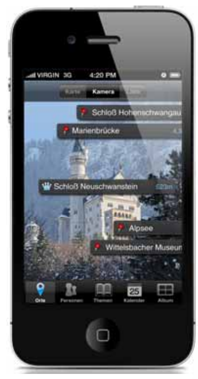
Illustration 5: Augmented reality app "Ludwig II." – castle Neuschwanstein

For example the camera image of the smart phone captures the outside view of castle Neuschwanstein. The geo-localisation and the compass of the smart phone simultaneously determine the exact location and the viewing direction of the viewer, and via real-time pattern recognition the virtual object to be overlaid (e.g. the donjon planned by Ludwig II, but never built, as a 3D reconstruction), which is stored in the app, is identified and inserted in the camera image in the appropriate place. The augmented reality application thus reconstructs virtually e.g. selected architectural designs planned by Ludwig II, but never realised, and integrates them in the camera image in their intended place. The app "Ludwig II" employs cutting-edge technology, giving an example how singular library content can be made available in the modern use scenarios of the digital world.