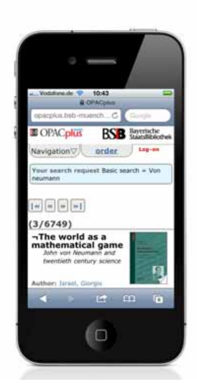
Illustration 1: Mobile OPAC of the Bavarian State Library

The re-design of the most important and most frequently used services of the Bavarian State Library as mobile applications started with the library's online catalogue with around 10 million titles, as well as the Bavarian Union Catalogue maintained by the Bavarian State Library with 22 million searchable titles. These services had to be comprehensively redesigned so as to adapt them to the usability requirements of gesture-controlled touch screens of modern smart phones. Both applications were developed as generic applications which run on all currently relevant mobile platforms: on Apple's iOS operating system for iPhones and iPads and on Android or Symbian-based mobile devices.