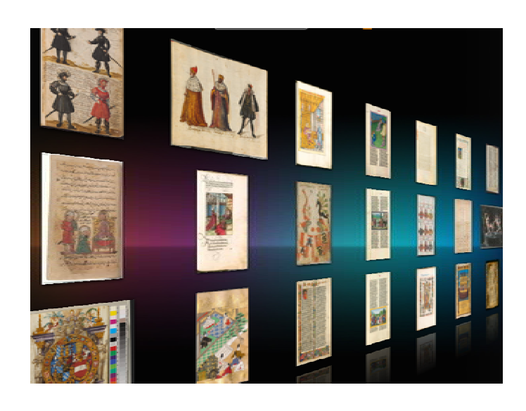
Illustration 7: Digitised manuscripts on a 3D image wall (prototype)

large data volumes on the basis of the image information via an image wall (3D wall), the image information being dynamically arranged as required. Similar image contents are to be locatable through an image-similarity search. It is intended to segment and arrange the digital media using topic categories and time-bar functions in such a fashion that classical text-based research is rendered largely superfluous. The user can thus comfortably browse the images of the works on the digital image wall, trigger an image-similarity search , and look more closely at the selected work using gesture-controlled, touch-based commands. By zooming in for example the high-resolution digitised details of individual images can be shown through very simple image-based control processes.