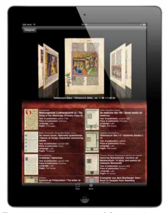
Illustration 3: "Treasures of the Bavarian State Library" as iPad application

"Famous Books" and "Oriental Books": Outstanding specimens of written cultural heritage as iPad applications