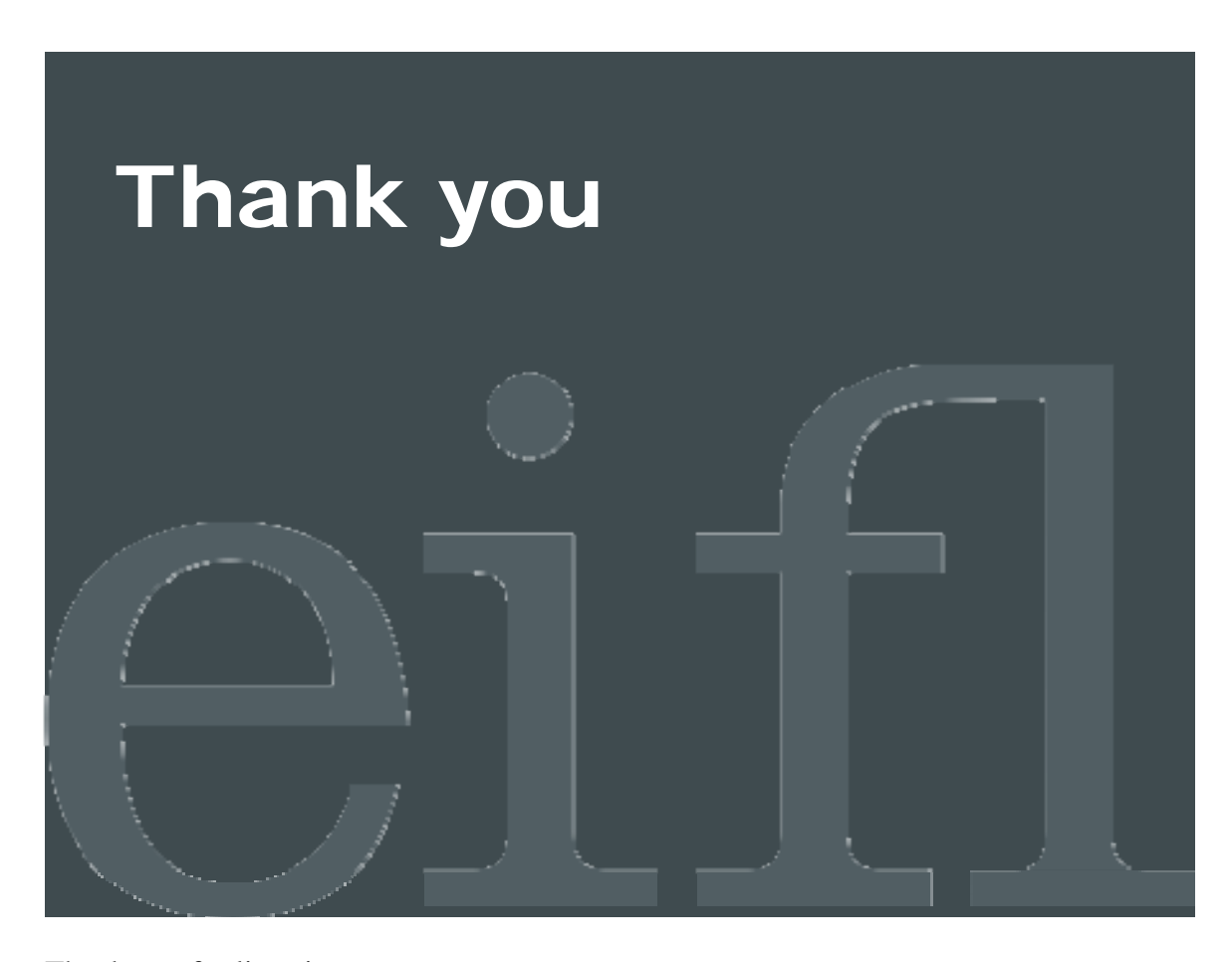
Thank you for listening.