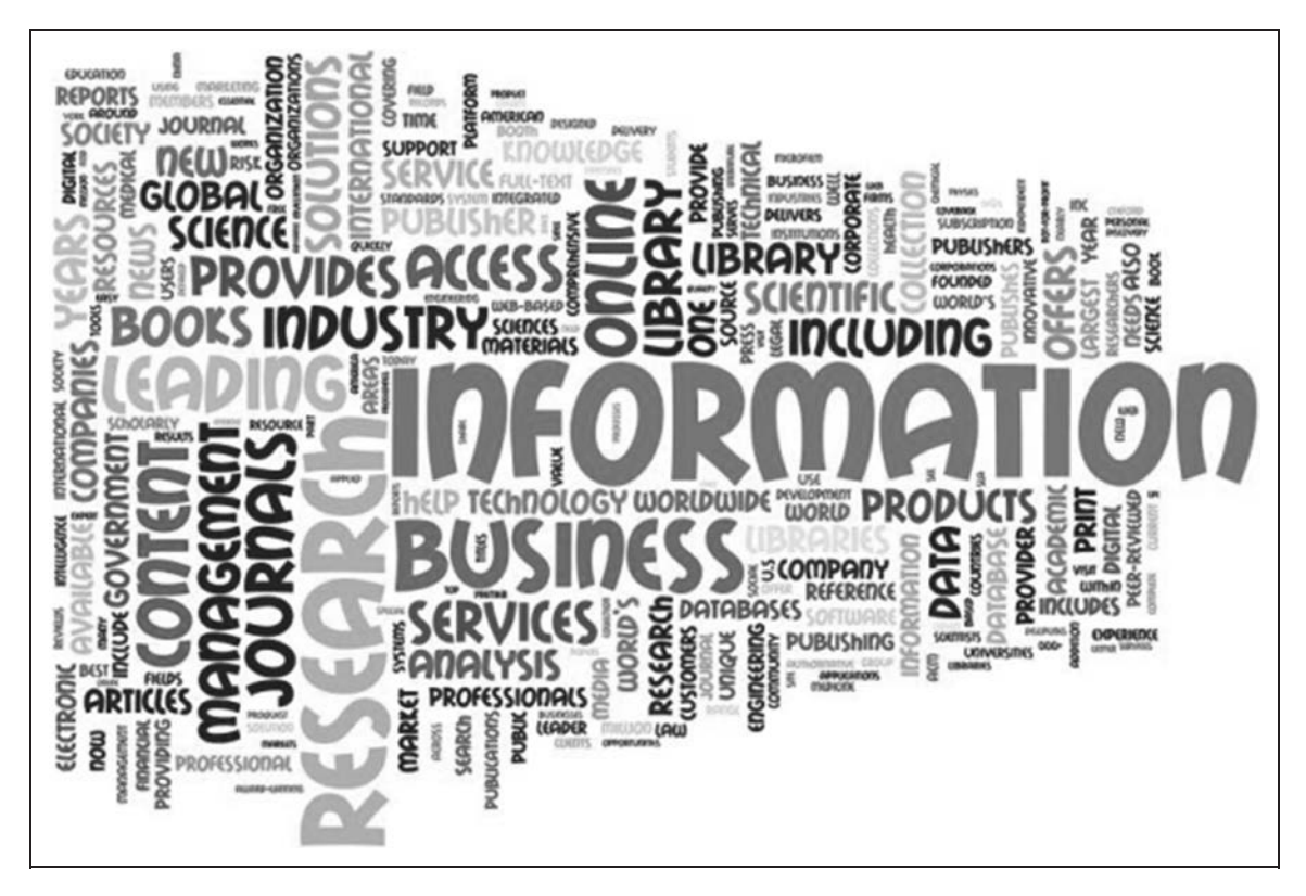
Figure 2. Management word map.

Within the context of this article, a library leader is defined as the individual who articulates a vision for the organization/task and is able to inspire support and action to achieve the vision. In the word map in Figure 1 (Peters, 2016) we see some of the characteristics common to library leaders.