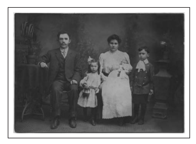
Figure 5. Same photograph from Figures 3 and 4, having been fully restored.

artifact, but simply an enhanced version of that artifact. In order to preserve credibility and trust, it is recommended that an online exhibit or digital collection display each image side-by-side for full