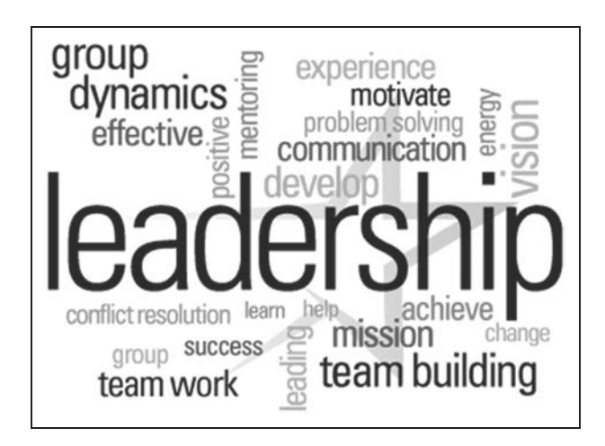
Figure 1. Leadership word map.

following seem as good as any for the purposes of this article. Defining these roles is, however, different from describing the characteristics needed to fulfill each successfully. Sometimes