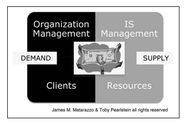
Figure 3. Competition for resources.

How might you proceed? If it is not already too late in your organization, you must create a strategic vision for how your library will deal with these inevitable reorganizations and cutbacks. Never forget it is at least a two-way street with yourself and your team as key stakeholders committed to achievable solutions. As a leader it is your job to get your team motivated towards accomplishing this vision through managers responsible for operationalizing it. This must be an aggressive and robust approach with a laser focus on those activities that will best support your parent organization's sustainability. For example, we know there have been significant changes in how all libraries handle ready reference. Recognize and accept this and build a new approach to the needs of your customers. Other programs/services which made sense 10 years ago may not be yielding the benefits anymore and can and should be discontinued. There are already several examples in all types of libraries where these changes are being made by networking and consulting the literature for examples you can adapt to your own organization, engage your stakeholders so you know what they need, not necessarily what you want them to have. Scenario planning is a great tool to use in this effort and with the right mindset and motivation you can position yourself to be as in control of the fate of your information services as possible during disruption (Matarazzo and Pearlstein, 2009).