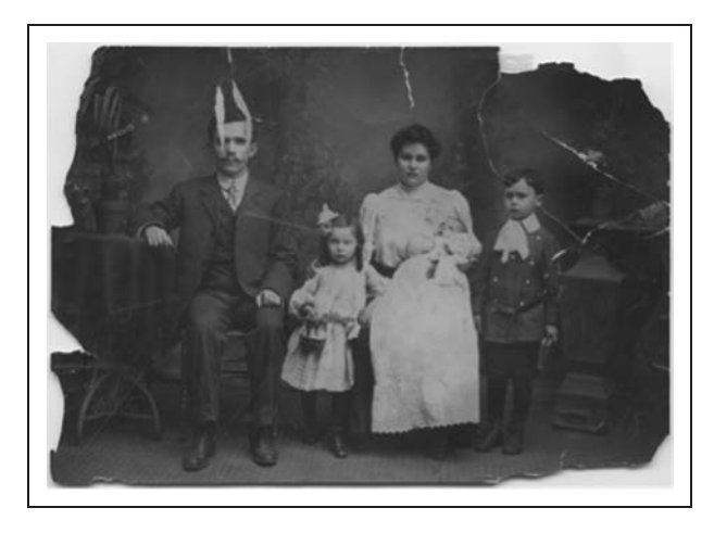
Figure 3. Scan of a circa 1907 photograph that has suffered physical damage.

A common example of performing steps to obtain original accuracy can be seen in the digital conversion of aged transparency slides. The different rate at which the dye layers degrade over time results in the increased or decreased appearance of particular colors based on the speed of degradation (Image Permanence Institute, 2004). In this situation, accurate digital capture will certainly present the artifact as it appears at the time of digital capture, but it will not necessarily produce the image as it likely appeared at the time it was created. To achieve original accuracy, the accurate digital capture will have to be manipulated during post-processing, and steps to correct the color will need to be taken. A resulting digital image is not a replacement of the physical