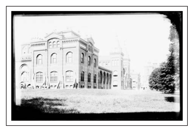
Figure 1. Scan of a dense glass plate negative having undergone no post-processing other than being inverted.

Although using a scanner with a greater optical density range will help capture a greater tonal gradient (Epson America, Inc., 2010), when working with extremely dense negatives the capture technique will play a vital role in revealing information