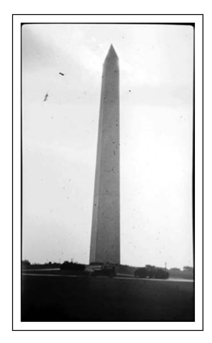
Figure 8. Black and white negative displaying numerous defects.

A relatively moderate example of improved aesthetics can be seen in Figures 8, 9, and 10. Figure 8 is a negative that was clearly not cleaned in any way prior to being scanned. As a result, in addition to any scratches that may be present, dust and hair are quite apparent on the resulting digital rendering. In fact, Figure 9 is a magnified view that makes clear the image of an ant that made its way onto the physical negative at some point in the negative's life. Although perhaps public appeal and academic pursuits are not inhibited as a result of visible dust particles, hair, or other defects, the overall aesthetics of the digital rendering are certainly improved by digitally "cleaning" the rendering during post-processing. Of course this raises the question as to whether attention should be given to those defects as part of the artifact or simply as foreign objects introduced into the image after the photograph was created. Depending on perspective, institutions may react differently in handling those defects. Figure 10 is the resulting image after having undergone this cleaning and other minor adjustments during post-processing.