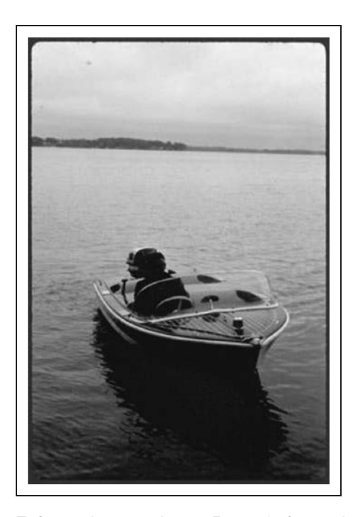
Figure 7. Same photograph as in Figure 6 after undergoing color adjustments.

Similarly, this phenomenon of dye degradation is not limited to only transparency slides, but it extends to any photographic format that uses dye combinations to produce a color image (Image Permanence Institute, 2004). Reactions to external or environmental conditions such as light, humidity, temperature, and handling can result in the accelerated degradation of materials, as well as lead to additional reactions among materials (Image Permanence Institute, 2004). Through the thoughtful application of post-processing adjustments, some of these naturally occurring and environmentally induced physical alterations can be corrected or reduced in a digital rendering.