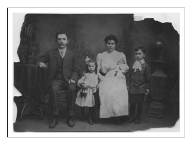
Figure 4. Same photograph from Figure 3, but having undergone some digital restoration.