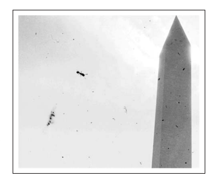
Figure 9. A close up of the upper left corner of Figure 8, highlighting some defects including an apparent ant.

Making adjustments during post-processing, if done in moderation and with a skilled eye, can enhance a user's experience from an aesthetic point of view. Viewing a once dye-faded transparency slide that now resembles color qualities of a photo taken yesterday; seeing an image once lost to an overexposed glass negative revealing details about an event 100 years earlier; or downloading an image that once was torn and scratched but is now digitally reassembled, are all examples of appealing to general users through applying moderate processes aimed at improving aesthetics. In the context of value, or impact, as it relates to a user's emotional response