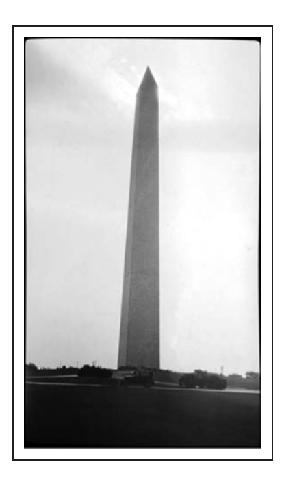
Figure 10. The same photograph as Figure 8, but having undergone digital "cleaning" to remove artifacts and defects.

while satisfying a sense of curiosity, or knowledge (Chen and Granitz, 2012), it is easy to understand how enhanced aesthetics and informational output have the potential of generating increased and improved use among general users.