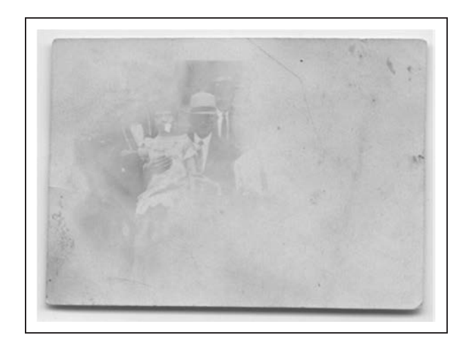
Figure 11. A photograph from circa 1925 that has become irreversibly faded over time.

designed to promote and support the public good (Bishoff and Allen, 2004), it is hard to imagine image manipulation as a tool for deception in the academic and cultural heritage fields. Rather, image manipulation in heritage collections should be approached with transparency in mind and result in providing greater access and an enhanced visual experience (Bishoff and Allen, 2004). The problem arises when manipulation crosses the line and becomes propaganda, misinformation, or downright forgery (Hofer and Swan, 2005). Although we hope that the cultural heritage field is insulated from such problems, there is currently no accepted industry standard for postprocessing of digital images equivalent to the digitization standards published by expert entities such as FADGI and Metamorfoze. As a result, it becomes difficult to know how much is too much, or if any at all is too much. The hope of this article is that what many in the field consider typical adjustments during pre- or post-processing are recognized to be accepted elements of image manipulation. It is not intended to cast a negative light on these manipulations, but rather to highlight and acknowledge that these changes are occurring during normal digital production workflows, and perhaps any alterations should be reflected in a digital object's metadata or in a digital production unit's written policies and procedures.