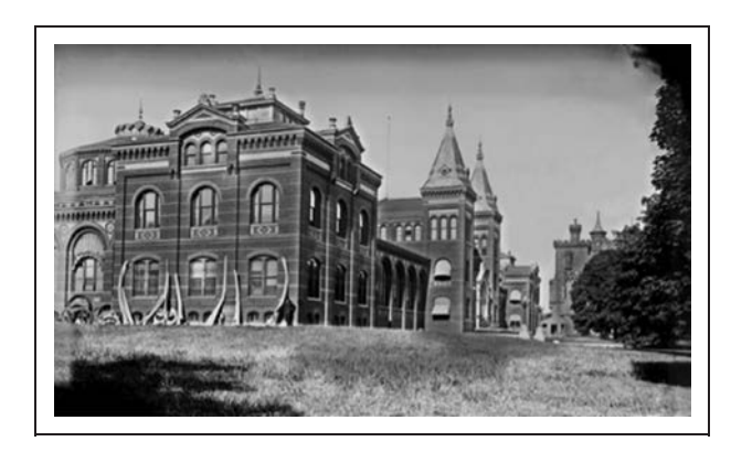
Figure 2. The same negative in Figure 1 after having undergone histogram adjustments and post-processing.

that may otherwise be obscured. As in the example above, the concentration of silver grains may be so dense as to not allow enough light to pass through regardless of adjustments to a scanner's histogram. In this situation, the capture technique must again be altered to yield a more complete set of information, and overcoming this issue calls for a more intense or directed light source. This uses the same concept that scanners use to capture transmissive materials (i.e. the transmissive material being placed between a light source and a sensor), but instead of using a scanner, a mounted digital single lens reflex (D-SLR) camera or a digital back paired with an external light source are used. By placing the transmissive material between the light source and the camera, more information can be captured among highlight values in a dense negative. It should be noted, however, that without taking the proper preprocessing steps, as in the above example, retrieving lost highlights becomes a potentially impossible task. Furthermore, even if the highlights are not entirely clipped, artificially enhancing information that is not fully present during post-processing may result in degraded image quality.