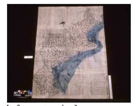
[Maps before and after restoration]