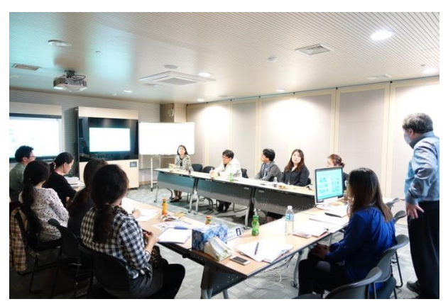
[Lecture by 3D scanning expert]

Scanning Techniques," connected to the previous year's expert meeting related to 3D printing. Experts from relevant organizations including the National Museum of Korea and the National Gallery of Modern and Contemporary Art attended the meeting, and a 3D scanning expert was invited to speak on the principles and types of 3D scanners, its applications and major uses, and instances of its use in the cultural asset preservation sector. There was also a discussion regarding methods for utilizing 3D scanners in various ways in exhibitions and restoration in association with the development of image technologies such as the future establishment of a 3D database, and 3D-related technologies currently adopted by individual organizations. Such technologies include the examination of sculpture preservation and the condition of oil paintings, the restoration of woodblock printing and printed copies, and the research and development of suspension to improve 3D scanning results.