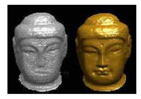
[Example of 3D scanning being used in the preservation of cultural properties]