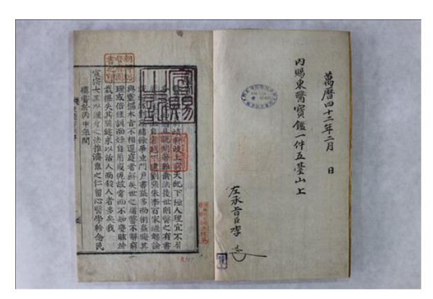
[Donguibogam at the National Library of Korea]

In 2016, the PAC Korea Center plans to continue introducing the Risk Register program to institutes housing cultural properties, and further promote listings of Korean materials, thereby protecting Korean cultural assets from disasters.