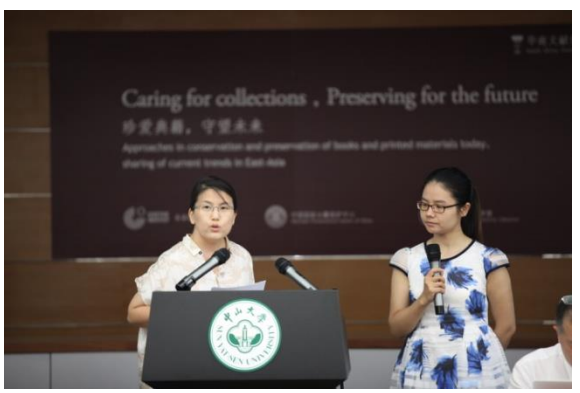
[Introduction of the PAC Korea Center]

The participating organizations agreed that in the future, consistent information exchanges and an Asian conservation network were necessary, and were encouraged to host and participate in an assortment of preservation-related events, such as materials conservation workshops.