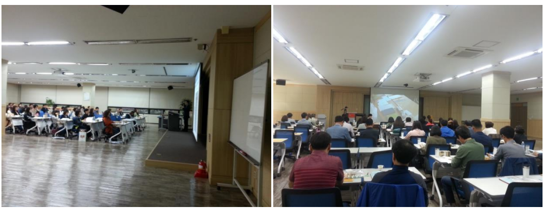
[Materials Preservation Courses]