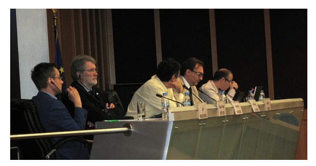
Working Sesión in progress

Different aspects were presented during the Working Session ranging from purely technical to systemic. The session began with two presentations about EBLIDA's role and how this relates to government information and the role of public libraries in giving access to this kind of information. Some of the issues discussed were the data economy and how big, linked and open data have found their way in Greek public administration. Towards that end, a presentation of the ISA (Interoperability Solutions for European Public Administrations) programme took place which triggered the discussion about technical issues to interoperability, relating particularly semantic, and its benefits for the public sector.