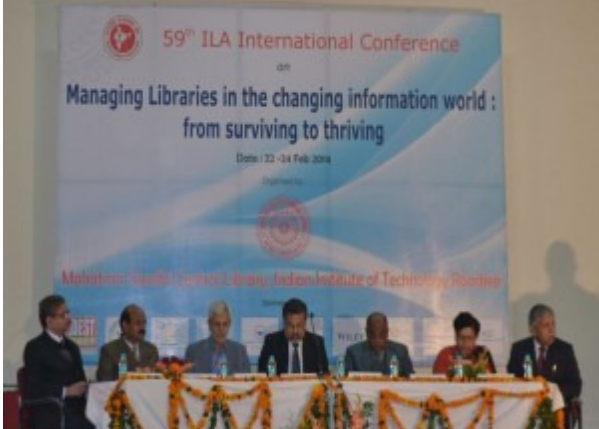
ILA inaugural session in progress

The 59th International Indian Library Association (ILA) Conference was organised by Mahatma Gandhi Central Library, IIT, Roorkee. More than 300 participants attended the conference where more than 60 papers were presented in 8 technical sessions.