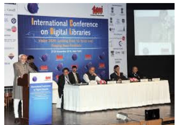
Hon'ble Vice President of India, Shri M Hamid Ansari delivering his inaugural address

The theme of the International Conference on Digital Libraries (ICDL) 2013, the fourth in ICDL series, was 'Vision 2020: Looking Back 10 Years and Forging New Frontiers'.