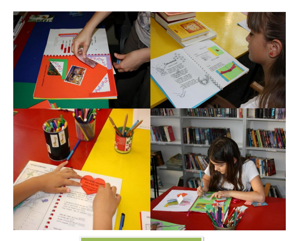
Children filling up their workbooks

poems by contemporary poets and different tasks tasks for kids to do.