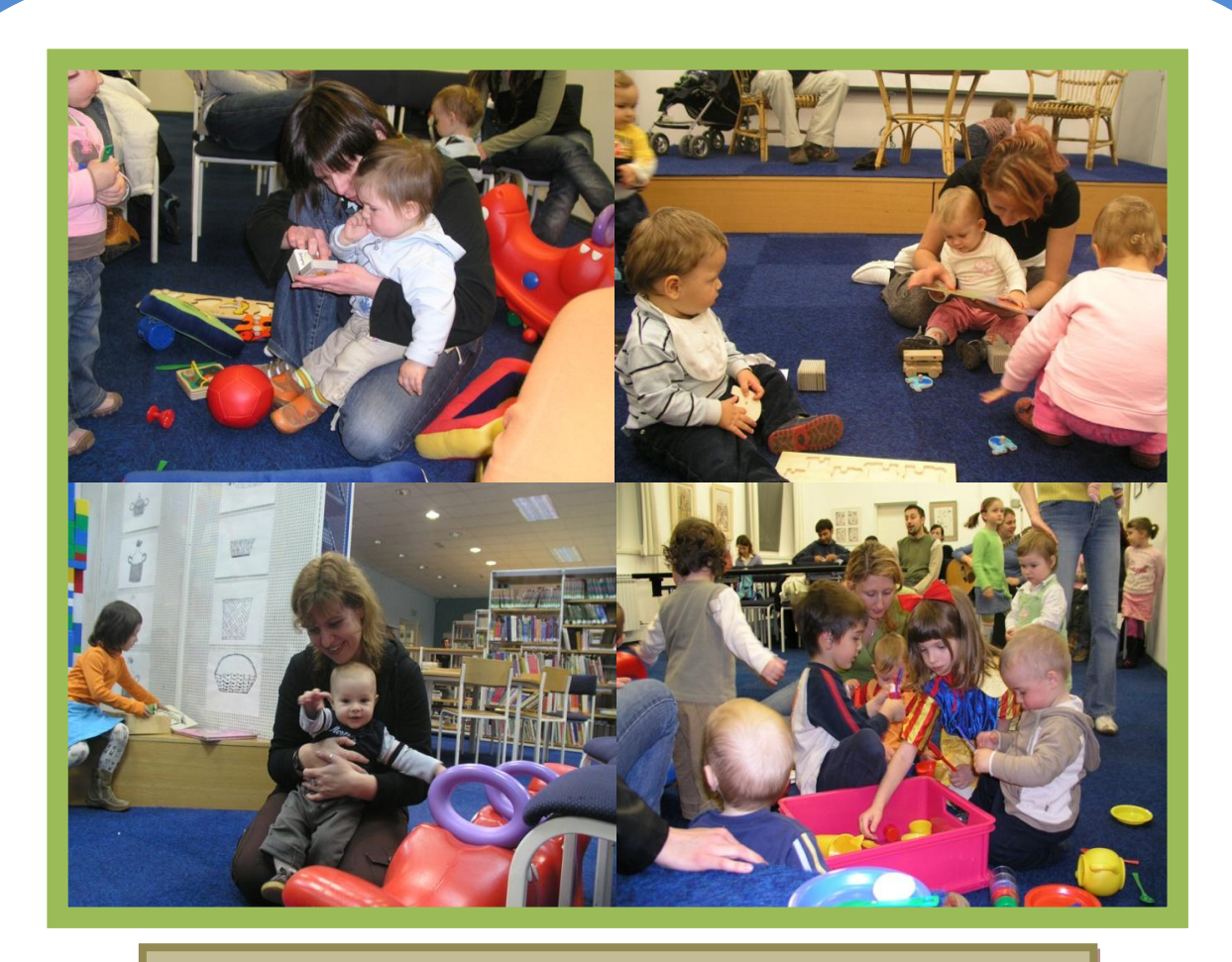
Room-filled activities for children to engage in reading activities and play at Zadar Public Library.

community health centers. Some libraries will work in cooperation with The Croatian Reading Association to share information and educational packages for newborn babies and their parents. The packages will include the info-leaflet on the importance of reading to children from their earliest years, and a picturebook. The UNICEF Office, in an effort to reach the most vulnerable groups of children, will support the distribution of the picture-book entitled Gledaj ova mala slatka lica ("Look at these little sweet faces") at regular medical examinations in pediatric clinics, with reading programs with parents, children and pediatricians. This presents a follow-up of the work of Marija Radonic (m.d.), the first Croatian pediatrician who recognized the importance of early reading. Some publishers will support the campaign by reducing prices of picture books for the youngest children, and The Croatian Radio joined the campaign as well, adjusting the "Bedtime Stories" program to youngest children.