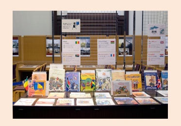
Favourites on Display