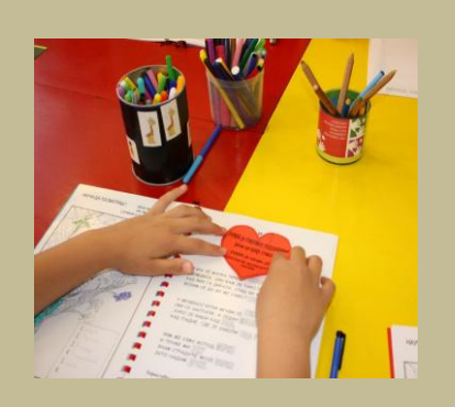
A Love for Poetry 14