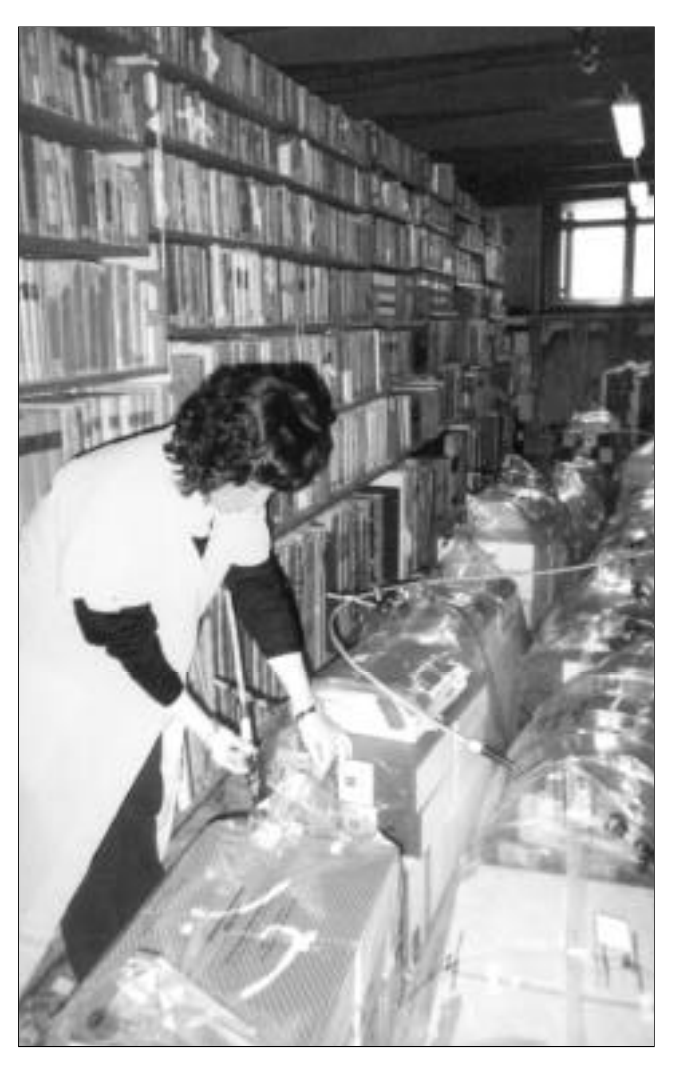
Treatment with Veloxy

finalement beaucoup enrichis. A fur et à mesure de l'opération, la dextérité du personnel s'est accrue et après avoir traité le grand dépôt de 200.000 livres, nous avons poursuivi l'intervention dans d'autres dépôts de fonds anciens afin d'éradiquer tout risque d'infestation.500.000 ouvrages ont donc été traités, cette opération de grande ampleur s'apparente à un traitement de masse sans pour autant en avoir les désagréments : manipulation intensive des ouvrages, éloignement, transport, changement de conditions climatiques, stockage, autant de dérangements qui parfois peuvent aggraver une situation déjà délicate.