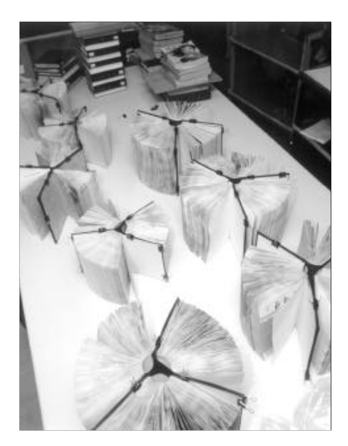
Drying Asian collection material; June 1998

The Library had a very lucky escape with smoke damage to the building and collections, and water damage to a large amount of material. It took a year of hard work to clean up and recover.