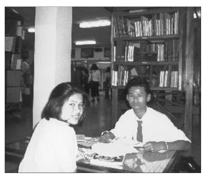
Mahasarakham University (students studying at the library). Behind them: a shelf representing a traditional bullock cart or an ox-drawn cart «kian».

Other significant issues of the meeting were optimal equipment for field recording and the problems of safe-guarding records under the strain of the technological revolution and emergence of the new media and carriers; digitisation; preservation and criteria for storage conditions and standards. These last aspects were largely covered by