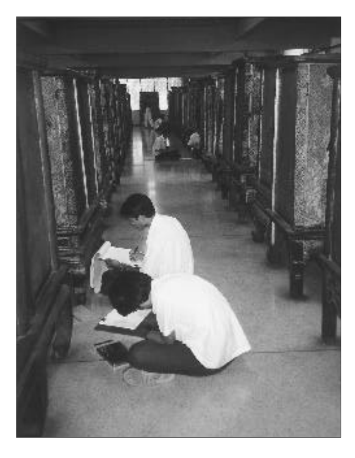
IFLA General Conference provided a chance to visit the National Library of Thailand. Here: students copying the drawings on ancient Thai bookcases, some of which date back to the 15th century.

Conditions of storing documents as the chief means of preserving the library holdings (As shown by the experience of the Russian State Library) by Olga Perminova and Tatjana Stepanova (Russian State Library, Moscow, Russian Federation), presented by Olga Perminova.