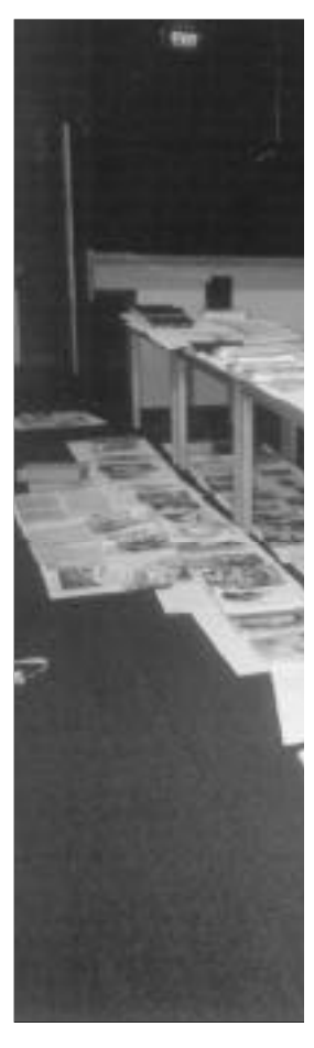
Drying Asian collection material at

However the Library now had a disaster plan and the fire detection and suppression system was upgraded over the next few years. We held fire drills and emergency evacuations and for a time we made good progress. But progress on developing a register of significant materials and priorities for salvage was slow and the co-ordinating emergency committee met irregularly.