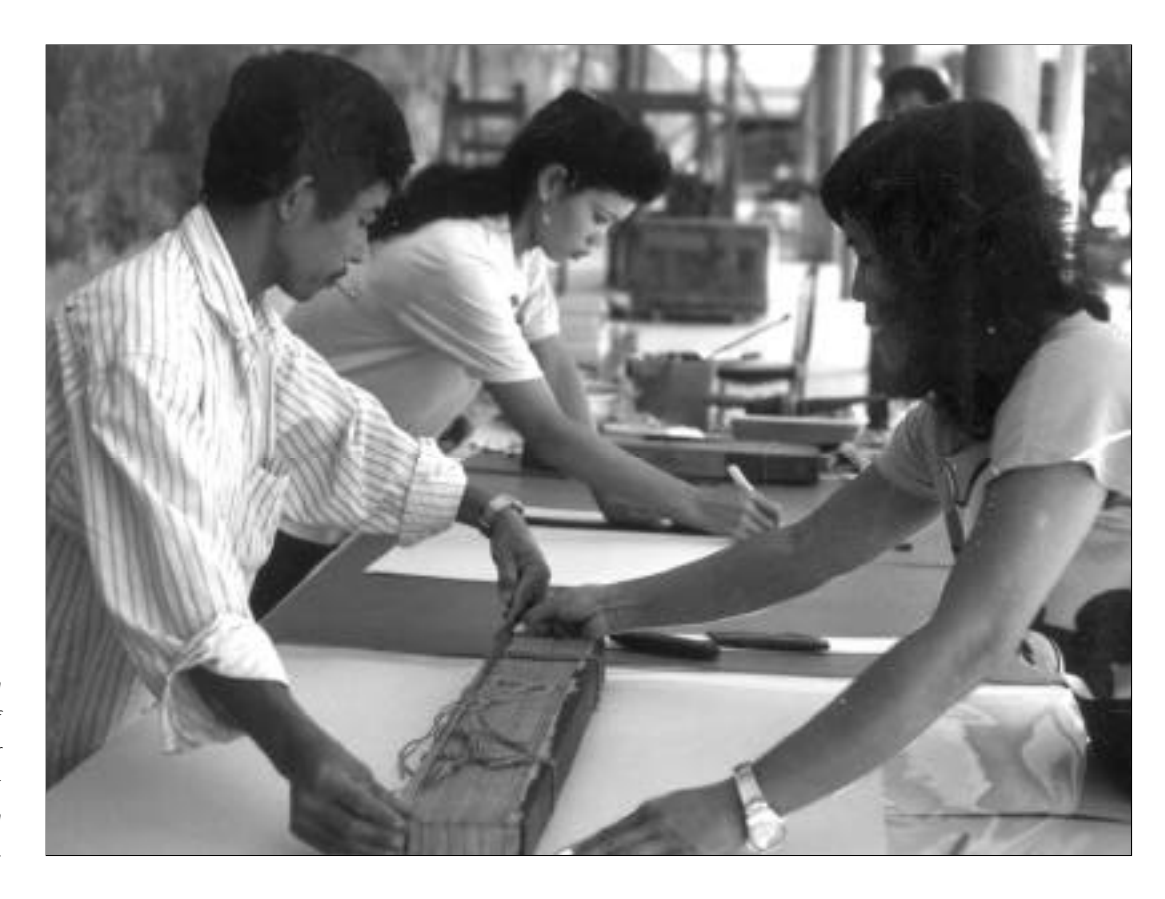
Library staff working on the construction of protective enclosures for palm-leaf manuscripts at the Royal Palace in Phnom-Penh, Cambodia.

new building, with predictable results. The library has since replaced these with aluminium shelves which has much improved the situation. A great deal of damage results from book structure distortion caused by trying to cram books onto too small, un-adjustable shelves, and often the shelf ranges are poorly oriented, blocking the circulation of air and allowing light damage from direct sunlight. Loose unsupported books are damaged by lack of compression which allows book structure distortion especially in conditions of high humidity, as the slumping books settle almost permanently into curved shapes.