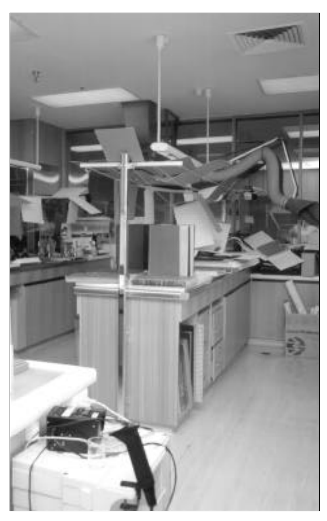
Preparing protective boxes. June 1998 incident

Special handling instructions provide relevant handling information for the range of material held by the Library. Appendices include a list of key personnel and emergency contacts in house and outside the Library as well as contacts for expert assistance. A listing of equipment and supplies held by the Library and available elsewhere is also included (1).