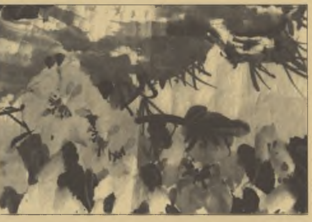
Effect of contrast after using light to expedite the fading.

These inventions were awarded gold and silver medals by the 1992 Beijing International Invention Exhibition and the First Class Rank