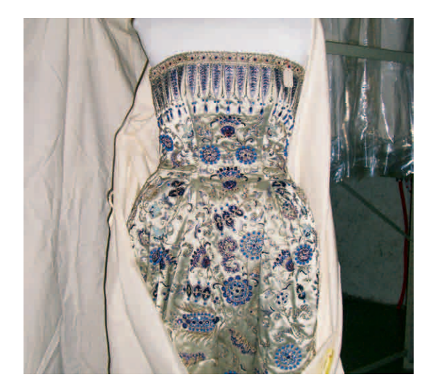
3. "Palmyre" Dress, Dior, Autumn 1954 Collection.

Sometimes, when required, a special packaging is made to measure, as it is the case for this Dior dress, preserved on a made-to-measure support.