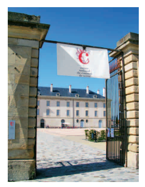
1. View of the National Centre of Stage Costume, at Moulins sur Allier, France.

Inaugurated in 2006, the National Centre of Stage Costume is the first institution in France and abroad which is entirely devoted to the theatre cultural heritage. 7110 costumes of theatre, opera and ballet are preserved, not to mention painted canvas scenery, coming from the three founding institutions of the centre, the Bibliothèque nationale de France, the Comédie-Française and the Opéra national de Paris.