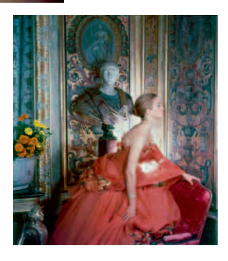
Beaton Fashion Shot. Fashion Shot for Advert in a textile magazine, 1953.