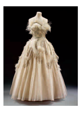
4. White silk organza, feathers and rhinestones. Pierre Balmain, early 1950's.