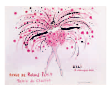
2. Original sketch for the costumes of Champagne rosé , revue of Zizi Jeanmaire, staged by Roland Petit. Copyright Fondation Pierre Bergé - Yves Saint Laurent.

A close friend of Zizi Jeanmaire and Roland Petit, he signed the sets and costumes for Champagne rosé , for the famous feather dress show, for Notre-Dame at the Opera Paris and for Cyrano de Bergerac as early as 1959.