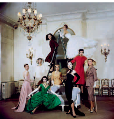
2. Dior Gowns. Christian Dior, 1957.