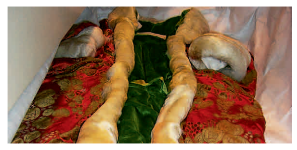
1. Poiret Dress, silk-velvet and swan, 1910.

The stacks of the Galliera Museum preserve 70 000 garments and 50 000 accessories on 4000m<sup>2</sup> in the best conditions of storage. The pieces are preserved hung up or laid down flat in drawers, under cotton dust covers, in an atmosphere of 50% of relative humidity and 18°C. Examples of beautiful pieces preserved in these stacks: