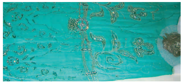
2. Beaded Dress, 20s.