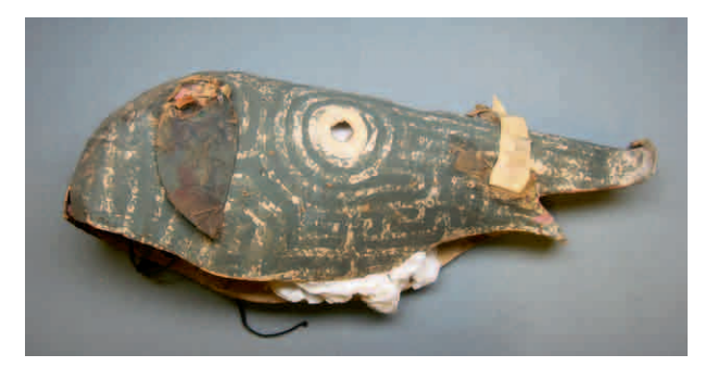
8. BnF-ASP Fonds Art et Action. Animal mask of wild boar designed by Fauconnet for Compère le Renard , Théâtre de la Renaissance, 1920. Painted paper and cardboard. Should a wild boar tusk, fixed with sticking plaster and painted over with gouache, be removed as it looks ugly, or kept in place as it belongs to the history of the mask?