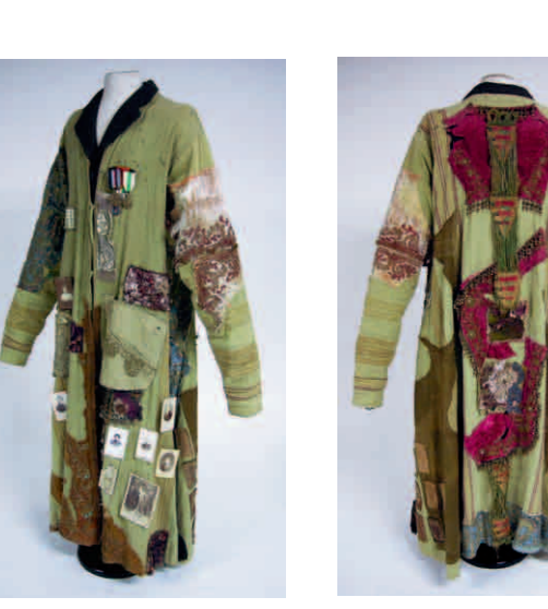
10-10 bis. Fonds Marcel Maréchal. Les Enfants du Paradis by Jacques Prévert, costumes designed by Christian Lacroix, Théâtre du Rond Point, 22 avril 1997.

This cloak is made of different kind of material: cotton cloth, velvet, but also photographs.