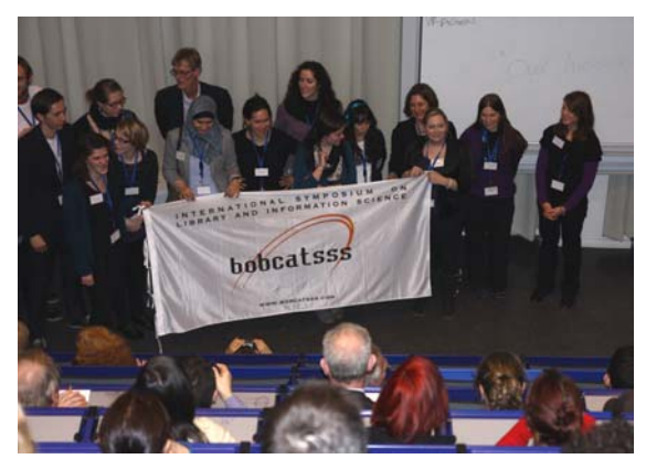
Handing over the BOBCATSSS flag to the Turkish 2013 organizers.

the uncommon accommodation situation most of the attendees shared international bed rooms in the Stay Okay Zeeburg Hostel - but in communication situations itself. Quite often we stood in a circle with students and young professionals next to teachers and vendors and vividly discuss industry trends, new teaching methods, political topics or ideas to a future library world above country borders. Or we discovered the best places in Amsterdam (no matter if museum, library, street or market) in a group with locals and international guests. While streaming a documentary about last years' "Cycling for Libraries" tour – a library unconference for cycling librarians and library lovers – we planned this years' ride through the Baltic States as well as topics for this years' IFLACamp in Finland in August 2012.