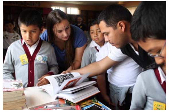
Students and staff check out the new books display during library day.

study or as part of assignments in coursework. Ultimately, LWB's Guatemala project aims to take a sustainable approach to international library work, by satisfying student learning needs while maintaining strong partnerships with international organizations.