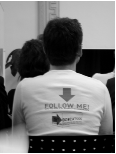
Follow me - BOBCATSSS 2007 in Prague!

Considering that BOBCATSSS is a unique series of symposia that are based on an idea of mutual cooperation between two European LIS schools, let us have a quick look at how one of these events is actually being prepared.