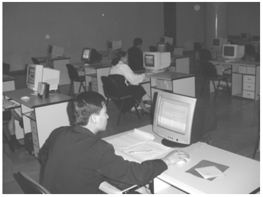
One of the multimedia reading rooms at the Great People Study House

Especially subject #1 "Parties policy" (consisting mainly of lecture + some self study) were a point of discussion figuring out to what extend this subject could include contents of the first of the eight core elements of the IFLA guidelines: "The Information Environment, Information Policy and Ethics, the History of the Field". Of course we did not expect a of the "western" complete coverage understanding of "policy". But after a certain discussion the proportion of this topic was reduced considerably while in the same time incorporating a more general understand of the term. The part of information technology and foreign languages are at an adequately high level.