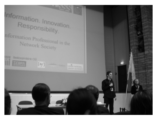
Estonian and Danish student organizers welcome BOBCATSSS participants to the opening ceremony at the National Library of Estonia

In Autumn 2004 when we became involved in this projected we knew very little about the challenges we were facing. Participating at BOBCATSSS 2005 in Budapest provided us with some valuable insight. The trip also gave us an opportunity to meet our Estonian coorganizers.