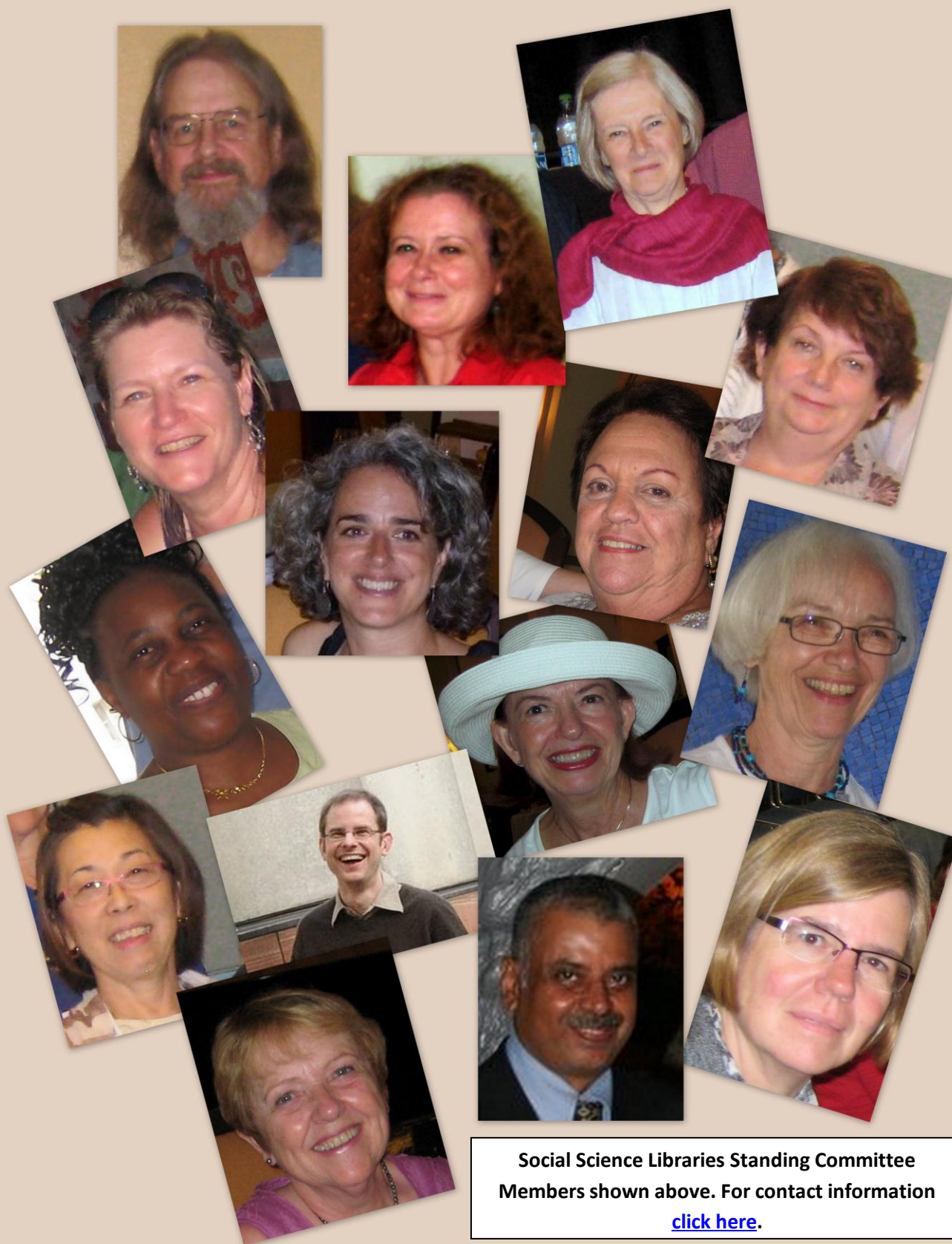
Social Science Libraries Standing Committee Members shown above. For contact information click here.