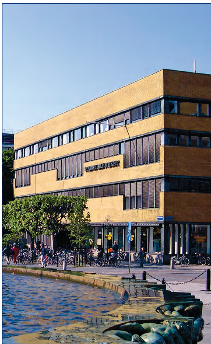
Gothenburg Public Library

New this year is that all IFLA delegates are offered the opportunity to make spontaneous visits to various libraries during the conference week. The central location of the Congress Centre makes this easy. We will present all the libraries in the region on a website and on-site in Gothenburg, all conference delegates will have a library map.