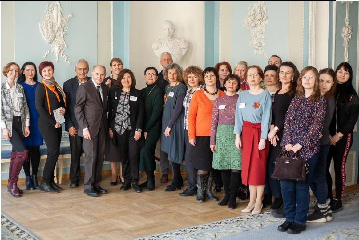
Group photo after the conference