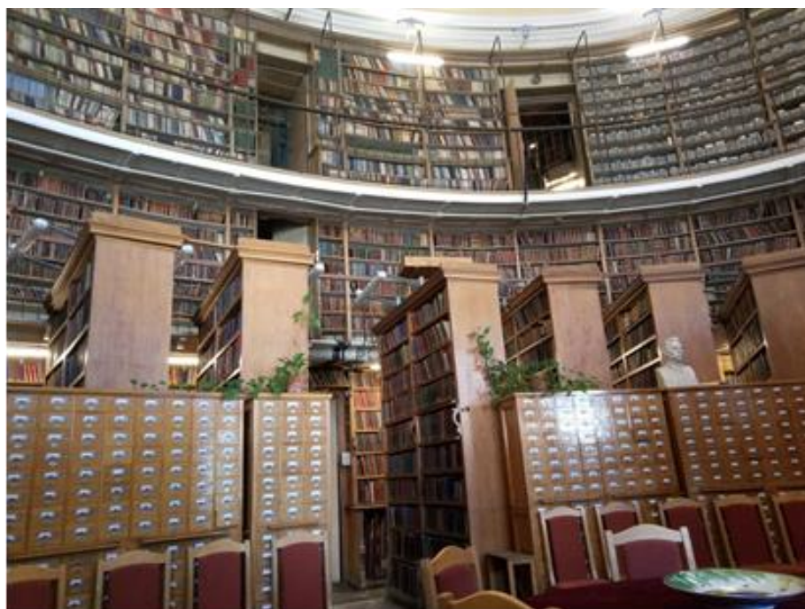
National Library of Russia - St. Petersburg – Oval Hall, opened on January 14th 1812

It is also planned to hold a special meeting at the All Russia State Library for Foreign Literature – the institution that sponsored the Russian translation of the Guidelines and which is a respected library leader in international professional activities. The meeting is scheduled for September – October, 2019 and will initiate a detailed conversation on the content of the document and its practical value for Russian librarians. The discussion will be followed by brainstorming in groups, to work out the practical steps on how to promote the key postulates of the Guidelines in the Russian professional library field.