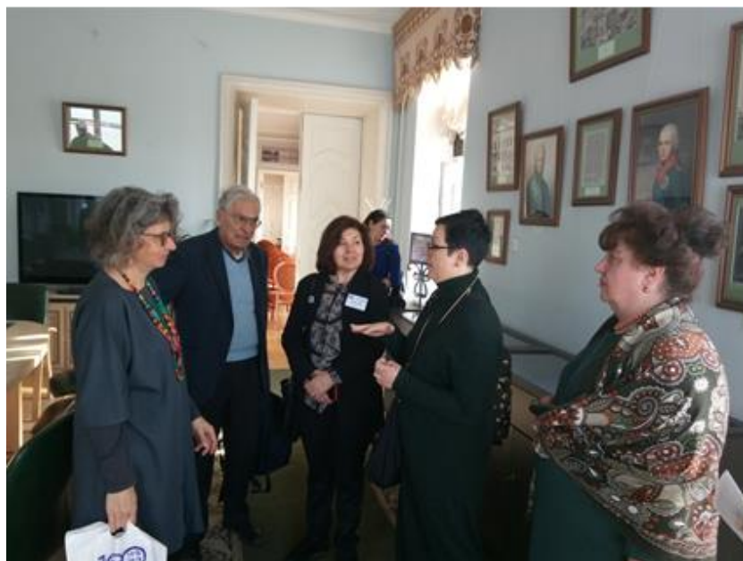
Visiting the University buildings