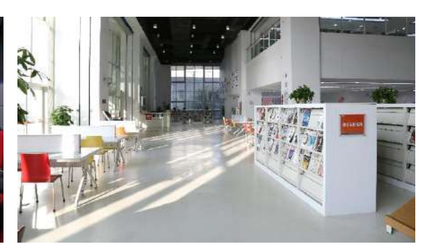
3000 sq.m. Self-service Library