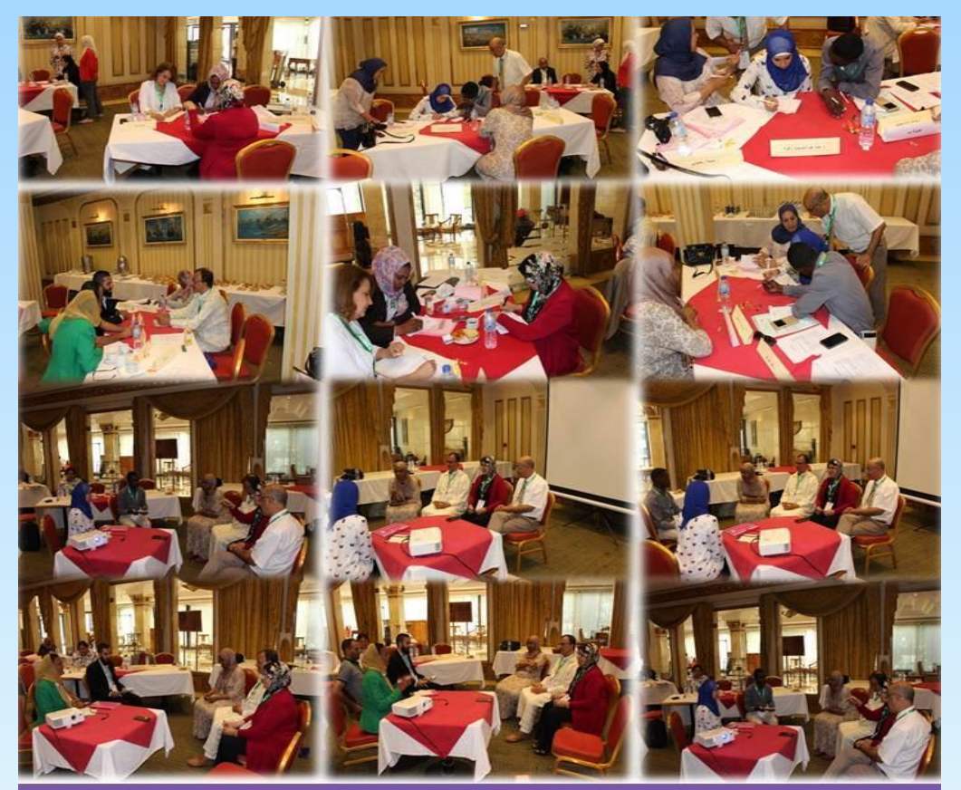
Role-playing activity The 2030 Arab Librarians Regional Meeting, 28-29 July, Cairo

Our Targets: Librarians who influence the influencers. Our Team: Arab Federation for Libraries & Information (AFLI) staff. Our Action(s): Online activities & Inperson activities Our Achievement(s): improvements in skills and knowledge; networking; linking the libraries activities with SDGS.