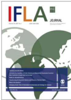
IFLA Journal, vol. 39, no. 1

This number includes news on recent IFLA activities and selected articles reflecting the diversity of the international information profession, including freedom of information, conservation, sight-impaired services and intellectual property.