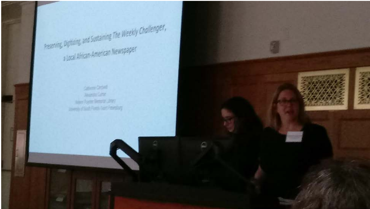
Figure 2: Cardwell and Curran, "Preserving, Digitizing, and Sustaining The Weekly Challenger"