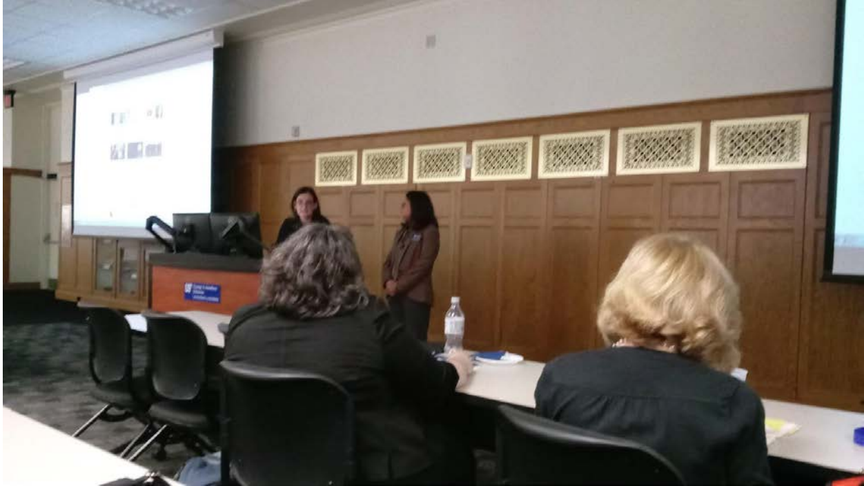
Figure 1: Drs. Vargas-Betancourt and Jefferson, "Digitization of Mexico's Jewish Heritage Newspapers"