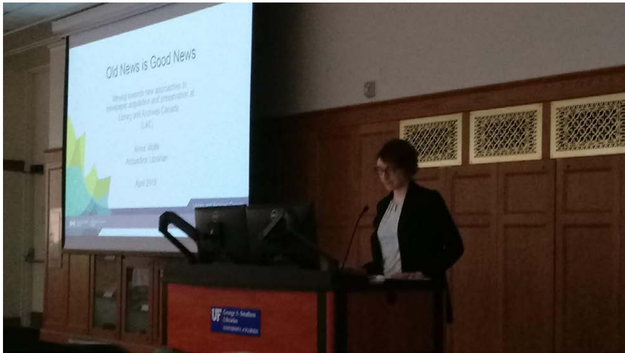
Figure 6: Annie Wolfe, Library Archives Canada