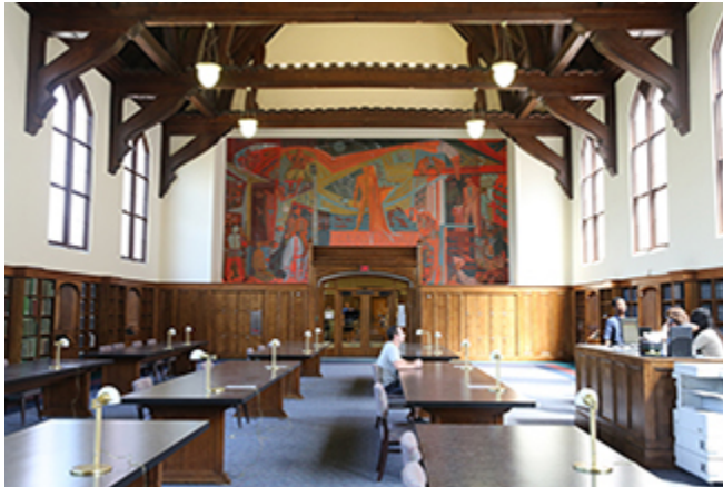
Figure 5:

End of Day 1 Reception: The reception for day 1 was held in the George Smathers Library Grand Reading Room (pictured below).