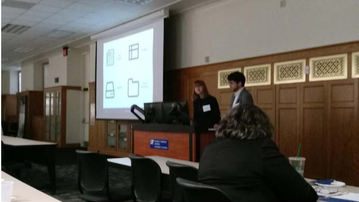
Figure 3: Schlaack and Oates, "Digital Migrations: A Case of Turn-of-the-Century Chicago Immigrant Newspapers"

Opening Guest Speaker: Deb Thomas, Library of Congress