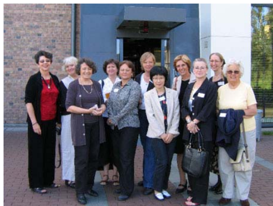
P&C Section members in Mo i Rana

http://www.netpreserve.org/about/index.php