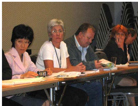
August 13 meeting