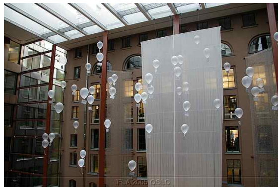
Opening of the National Library