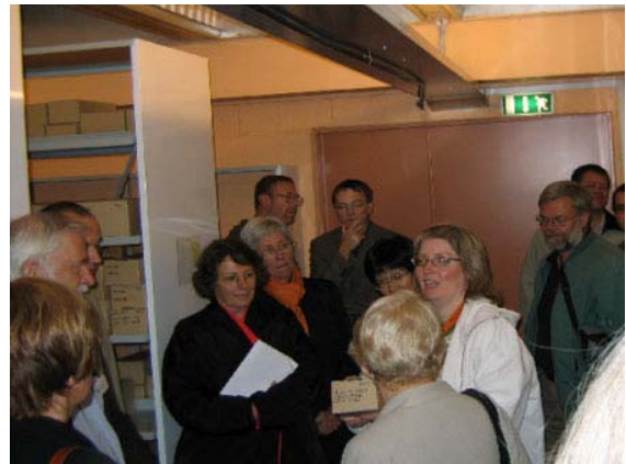
Tour of the Vault