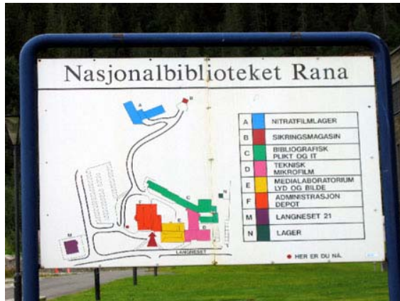
National Library of Norway (NLN), Mo i Rana