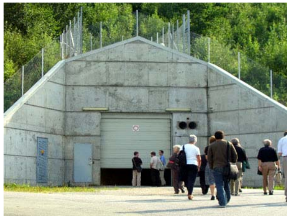
Mountain Storage Vault - Exterior