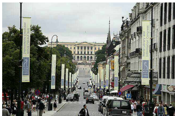
Main Street Oslo with IFLA Banners