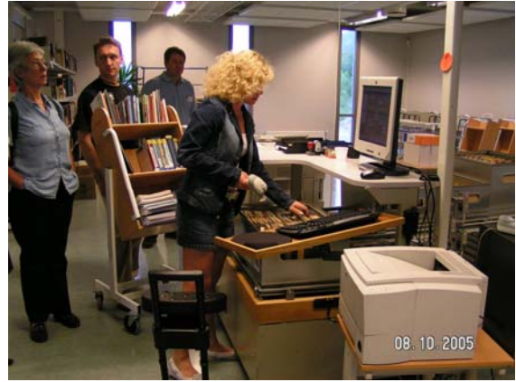
Repository Library – Processing Centre