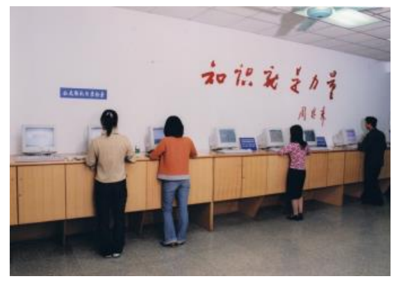
(The first multimedia reading rooms set up in 1997 and the OPAC terminals area soon after)

When the library re opened by the end of 2011, we did not set up separate multimedia reading rooms like before, instead, we set up mixed layout physical spaces in the non dividers reading rooms, over 200 computers were distributed along side of print collections, and WiFi available. With green plants and fashionable style sofas, as well as cultural decorations in festival seasons, reading surrounding has become very nice and attractive. In 2013, we received 6,336,420 visitors; here they enjoyed print or digital reading and social contact with friends or family, all in one place.