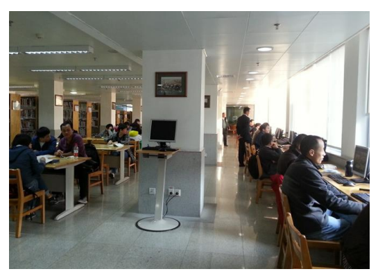
(Mixed layout in physical spaces since 2011)