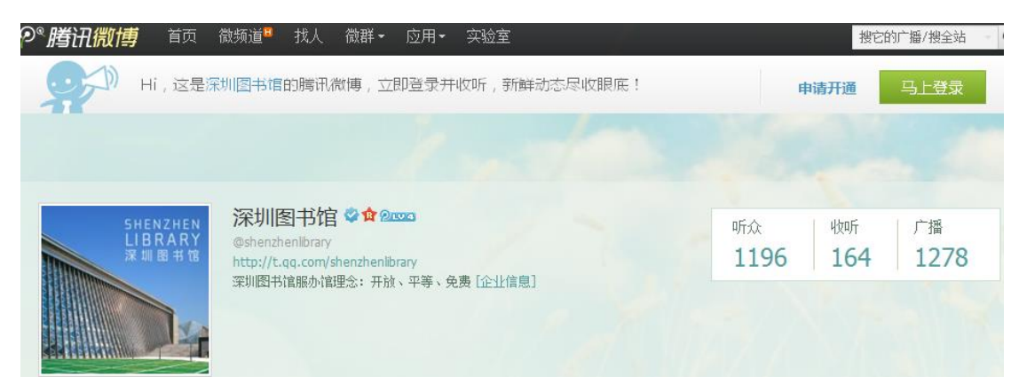
(Tencent Microblog community in 29 June 2014)

Shenzhen Library is one of the tens of public libraries in Guangdong Province setting up WeChat official account to serve people on their mobile terminals. You can search OPAC, check your borrowing, renewing or reservation. You can bind your WeChat account with your Reader Card. Once you locate the library official account with your WeChat account and add to your attention, you will receive library events news everyday, such as lectures and reading salons, also new arrivals and reading ranks. It is a very popular way promoting library to young users group online.