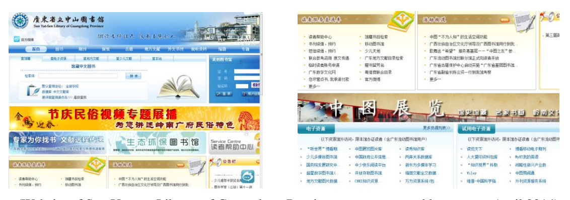
(Website of Sun Yat-sen Library of Guangdong Province, upper part and lower part, April 2014)

Sun Yat-sen Library of Guangdong Province began its automatic management in early 1980s. Through the Database of Guangdong Local literatures in 1986, the Library Microcomputers All-purpose Management System in 1988 and the first domestic ZSLAIS Provincial Library Automation Integrated System in 1994, our first website was set up in 1998. Since it was developed into a digital library in 2004, a wide range of e-resources has been added up. What is more important, it tends to deliver whatever happening in the physical space.