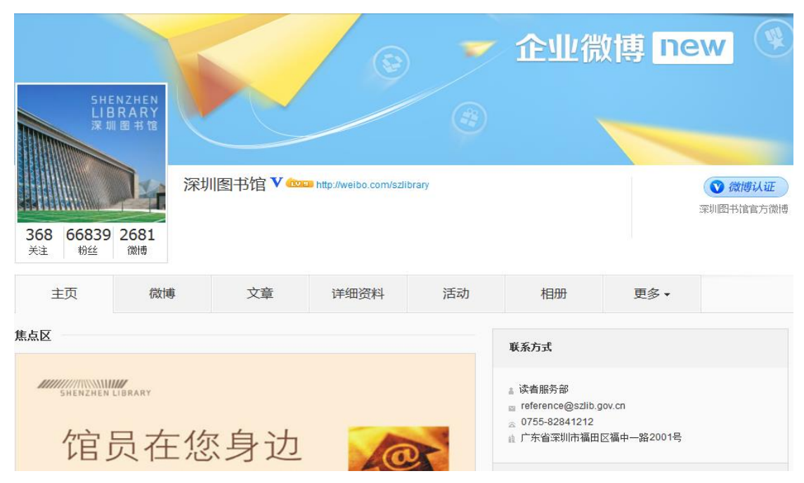
(Sina Microblog community in 29 June 2014)