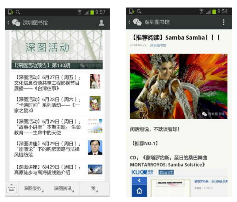
(WeChat Messages on Author's cell phone in 29 June 2014)