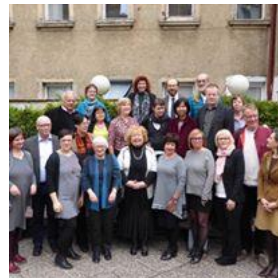
PLS members in Zagreb