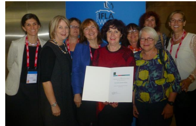
Winners of the IFLA Professional Unit Communication Award 2015

We were delighted to work with the City of Cape Town Library Service and the Western Cape Provincial Library Service to present the very practical 2016 Congress Public Libraries at the Crossroads satellite. Approximately 120 South African and international professional colleagues progressed solutions for their service delivery options with their colleagues from around the world. Our hosts worked tirelessly to present this event and I know their work was extremely valued and very much appreciated.