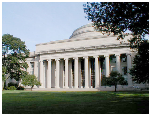
MIT, Barker Engineering Library Coupole.