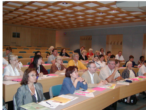
Study tour participants at MIT. Photo Ray Schwartz.