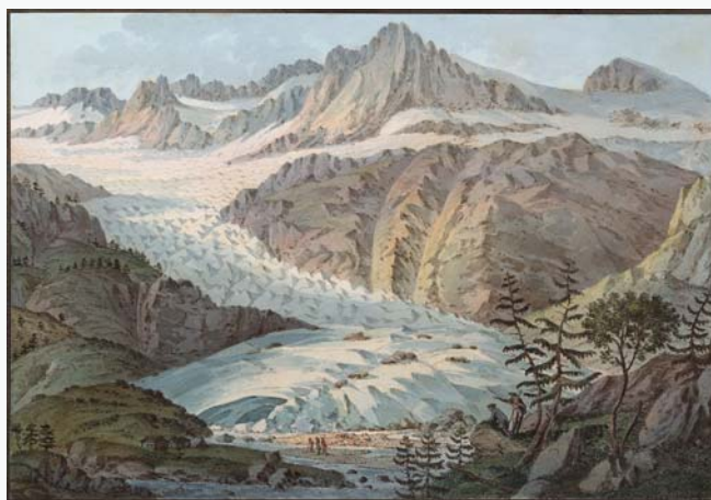
CAPTION: "The three transparent sources rise at the back of the hill, at the basis of which stand the small chalets or huts, as represented in the drawing, the author having taken the view from the top of a small plateau, or flat surface, which commands the extensive glacier of La Furca, and icy Vault, from where issues a part of the Rhône, as described. On the right stands the mountain which bears its name, and on the left the basis of the Grimsel"

"Source of the Rhône and glacier of La Furca", Albanis Beaumont Jean-François, Travels from France to Italy through the Lepontine Alps, London, 1800, Bibliothèque cantonale et universitaire de Lausanne, cote: AC 389